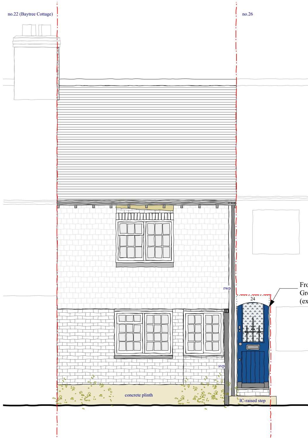
1. FRONT (SOUTH) ELEVATION