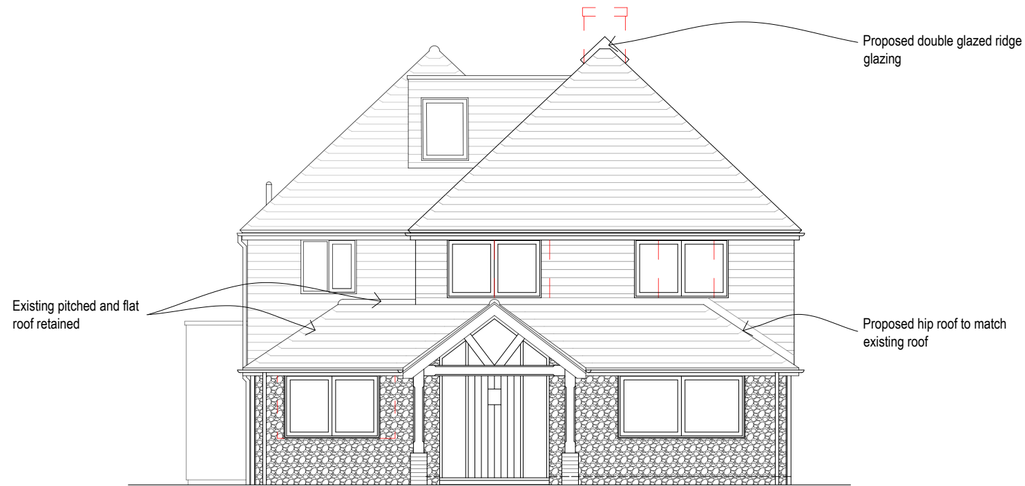
FRONT (NORTH WEST) ELEVATION - AS PROPOSED

TO BE READ IN CONJUNCTION WITH STRUCTURAL ENGINEER'S DRAWINGS, DETAILS AND SPECIFICATIONS