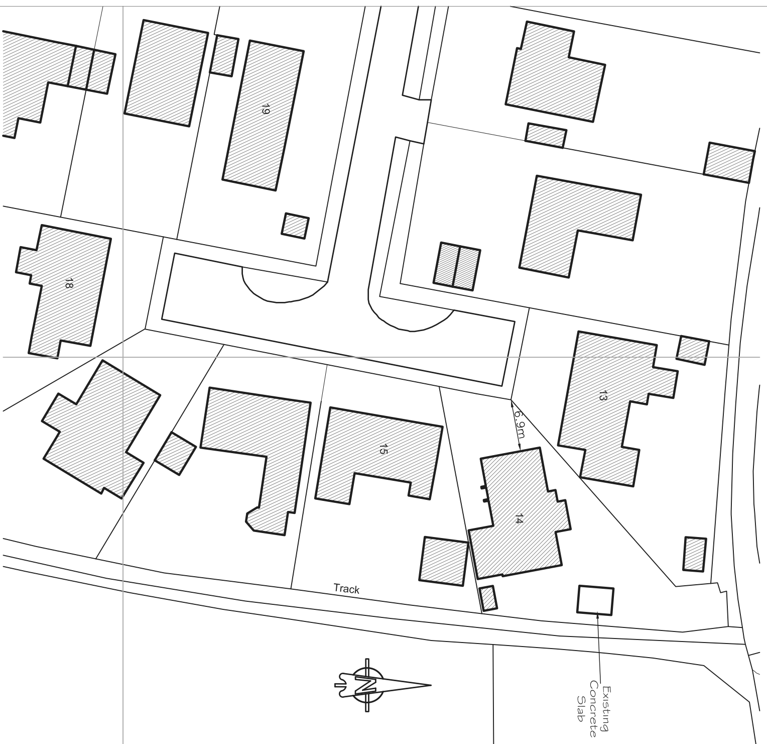
Existing Site Block Plan 1:500 @ A3

NOTES: The contractor, sub-contractor or supplier is to check all relevant dimensions together with existing structure and materials together with existing levels. ANY DISCREPANCIES ARE TO BE BROUGHT TO THE ATTENTION OF THE ARCHITECTURAL DESIGNER. © This drawing is copyright and may not be copied, reproduced or used in any way without the written permission of the Architectural Designer.