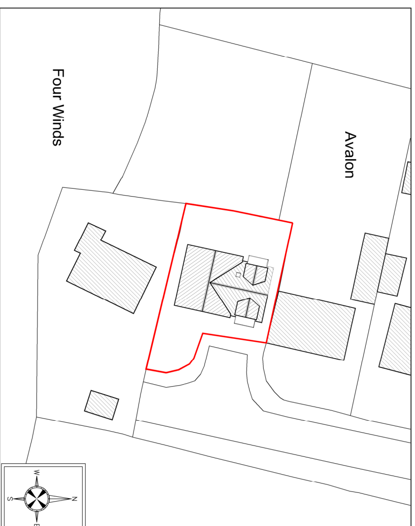
PROPOSED BLOCK PLAN SCALE 1:500