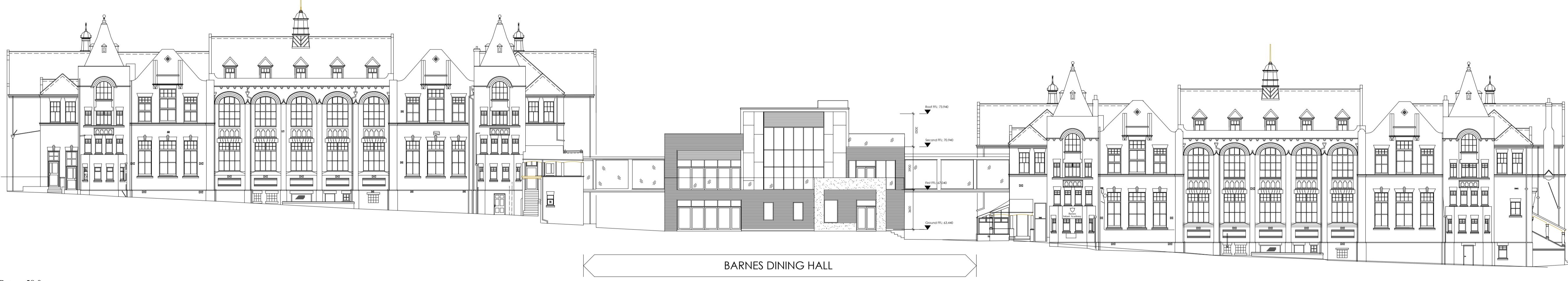
Datum 58.0m South Elevation