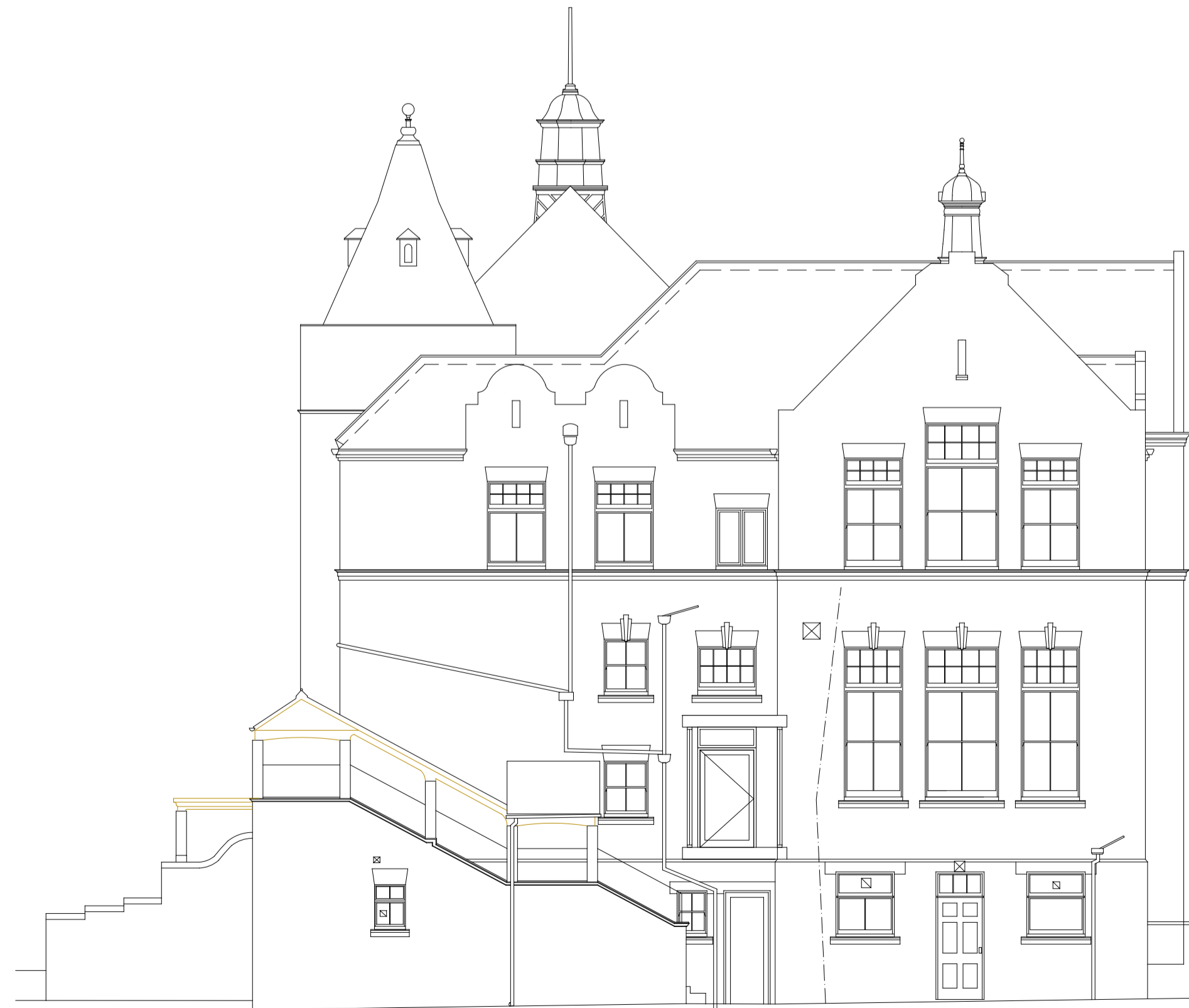
LINK CONNECTION - PROPOSED EAST ELEVATION

PROPOSED MATERIALS SPECIFICATION: SOUTH ELEVATION: WALLS: SELECTED BRICKWORK TO MATCH EXISTING SELECTED ALUMINUM CLADDING ALUMINUM DOUBLE GLAZED WINDOWS AND DOORS ALUMINUM COPINGS TO PARAPETS NORTH ELEVATION: WALLS: SELECTED BRICKWORK TO MATCH EXISTING SELECTED ALUMINUM CLADDING ALUMINUM DOUBLE GLAZED WINDOWS AND DOORS ALUMINUM COPINGS TO PARAPETS EAST ELEVATION: WALLS: SELECTED BRICKWORK TO MATCH EXISTING SELECTED ALUMINUM CLADDING ALUMINUM DOUBLE GLAZED WINDOWS AND DOORS ALUMINUM COPINGS TO PARAPETS WEST ELEVATION: WALLS: SELECTED BRICKWORK TO MATCH EXISTING SELECTED ALUMINUM CLADDING ALUMINUM DOUBLE GLAZED WINDOWS AND DOORS ALUMINUM COPINGS TO PARAPETS FIRST FLOOR TERRACE: CONCRETE PAVING FLAGS PLANTER BOXES REFER TO LANDSCAPE LAYOUTS SECOND FLOOR TERRACE: CONCRETE PAVING FLAGS PLANTER BOXES REFER TO LANDSCAPE LAYOUTS TOP LEVEL ROOF: SEDUM ROOF FINISH