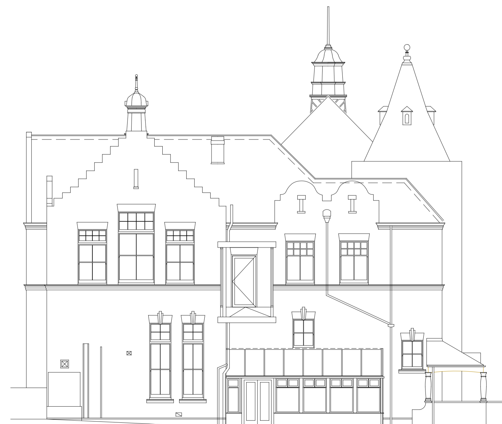
LINK CONNECTION - PROPOSED WEST ELEVATION

PROPOSED MATERIALS SPECIFICATION: SOUTH ELEVATION: WALLS: SELECTED BRICKWORK TO MATCH EXISTING SELECTED ALUMINUM CLADDING ALUMINUM DOUBLE GLAZED WINDOWS AND DOORS ALUMINUM COPINGS TO PARAPETS NORTH ELEVATION: WALLS: SELECTED BRICKWORK TO MATCH EXISTING SELECTED ALUMINUM CLADDING ALUMINUM DOUBLE GLAZED WINDOWS AND DOORS ALUMINUM COPINGS TO PARAPETS EAST ELEVATION: WALLS: SELECTED BRICKWORK TO MATCH EXISTING SELECTED ALUMINUM CLADDING ALUMINUM DOUBLE GLAZED WINDOWS AND DOORS ALUMINUM COPINGS TO PARAPETS WEST ELEVATION: WALLS: SELECTED BRICKWORK TO MATCH EXISTING SELECTED ALUMINUM CLADDING ALUMINUM DOUBLE GLAZED WINDOWS AND DOORS ALUMINUM COPINGS TO PARAPETS FIRST FLOOR TERRACE: CONCRETE PAVING FLAGS PLANTER BOXES REFER TO LANDSCAPE LAYOUTS SECOND FLOOR TERRACE: CONCRETE PAVING FLAGS PLANTER BOXES REFER TO LANDSCAPE LAYOUTS TOP LEVEL ROOF: SEDUM ROOF FINISH