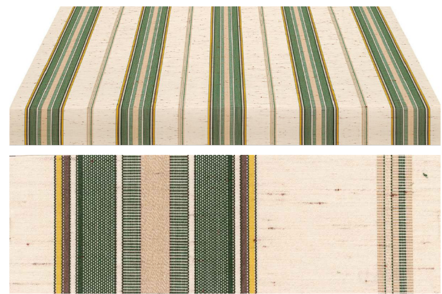
2 Awning Shade Fabric NTS