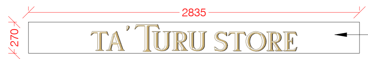
3 Detail 1: Fascia Sign 1:10 @ A2