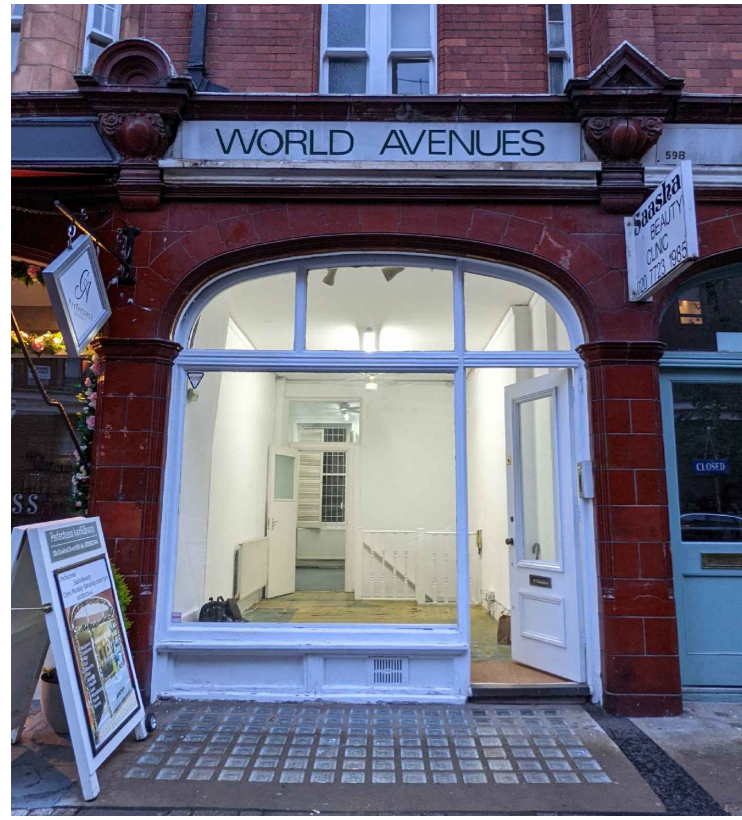
1 Existing External Elevation NTS