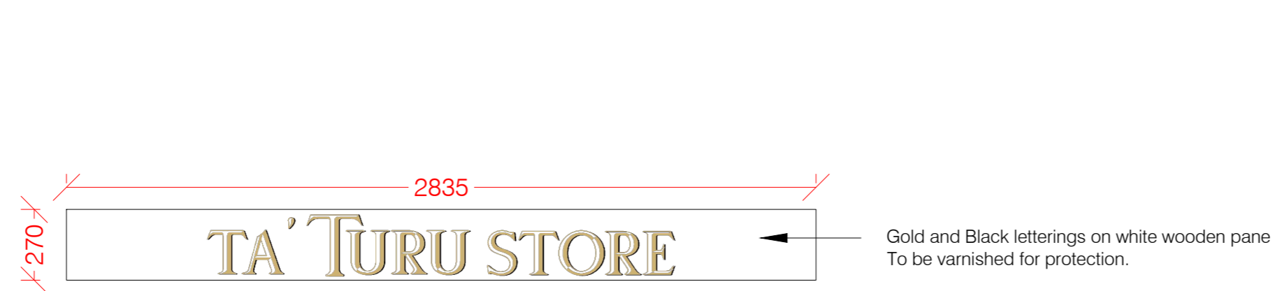
4 Detail 1: Fascia Sign 1:10 @ A2