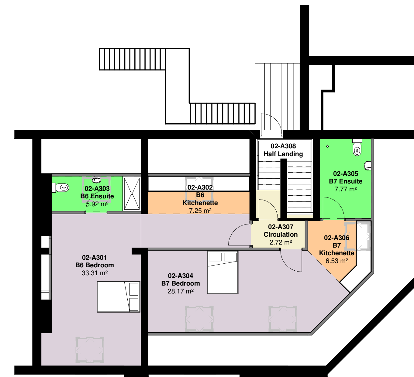
1 20-00_GA Plan as Proposed - Level 00 1:100