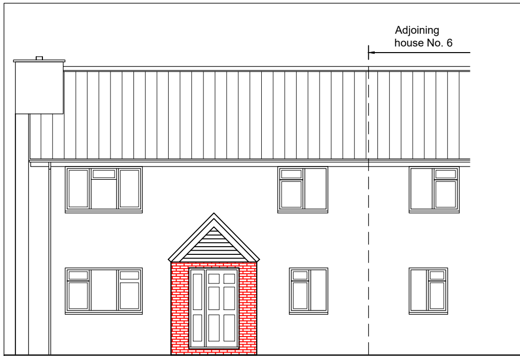
Proposed Front West Elevation Scale 1:100