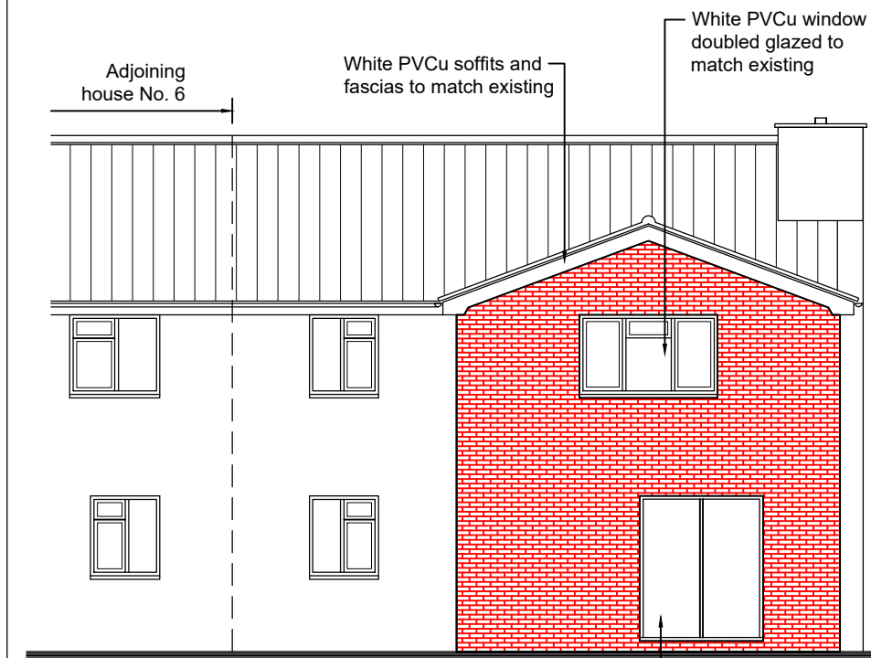
Proposed Rear East Elevation Scale 1:100