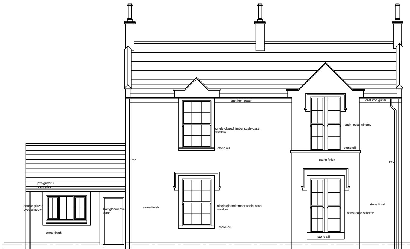
Existing North Elevation scale 1:100