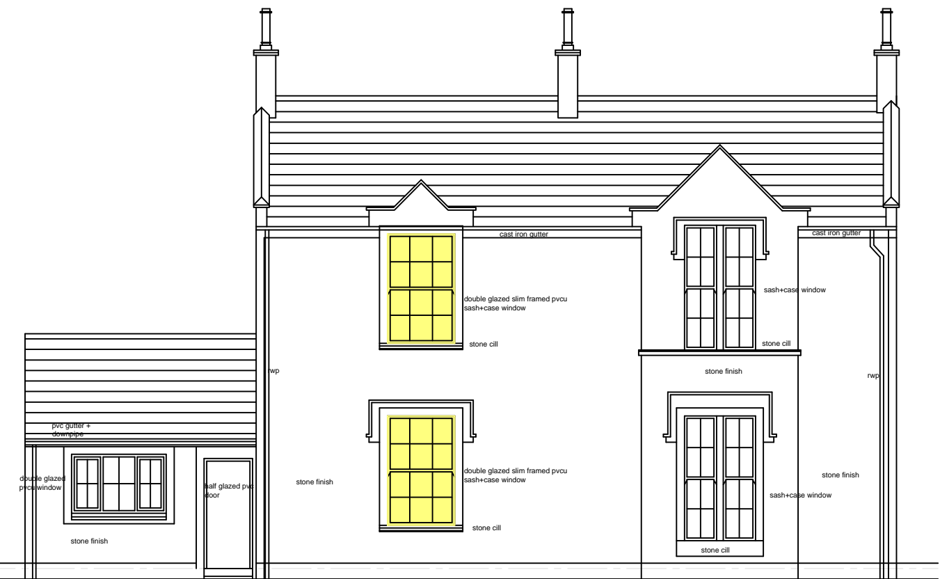
Proposed North Elevation scale 1:100