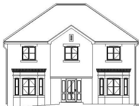
Plot 136 (s)

This copy has been made by or with the authority of Midlothian Council pursuant to Section 47 of the Designs and Patents Act 1988. Unless that Act provides a relevant exception to copyright, the copy must not be copied without the prior permission of the copyright owner.