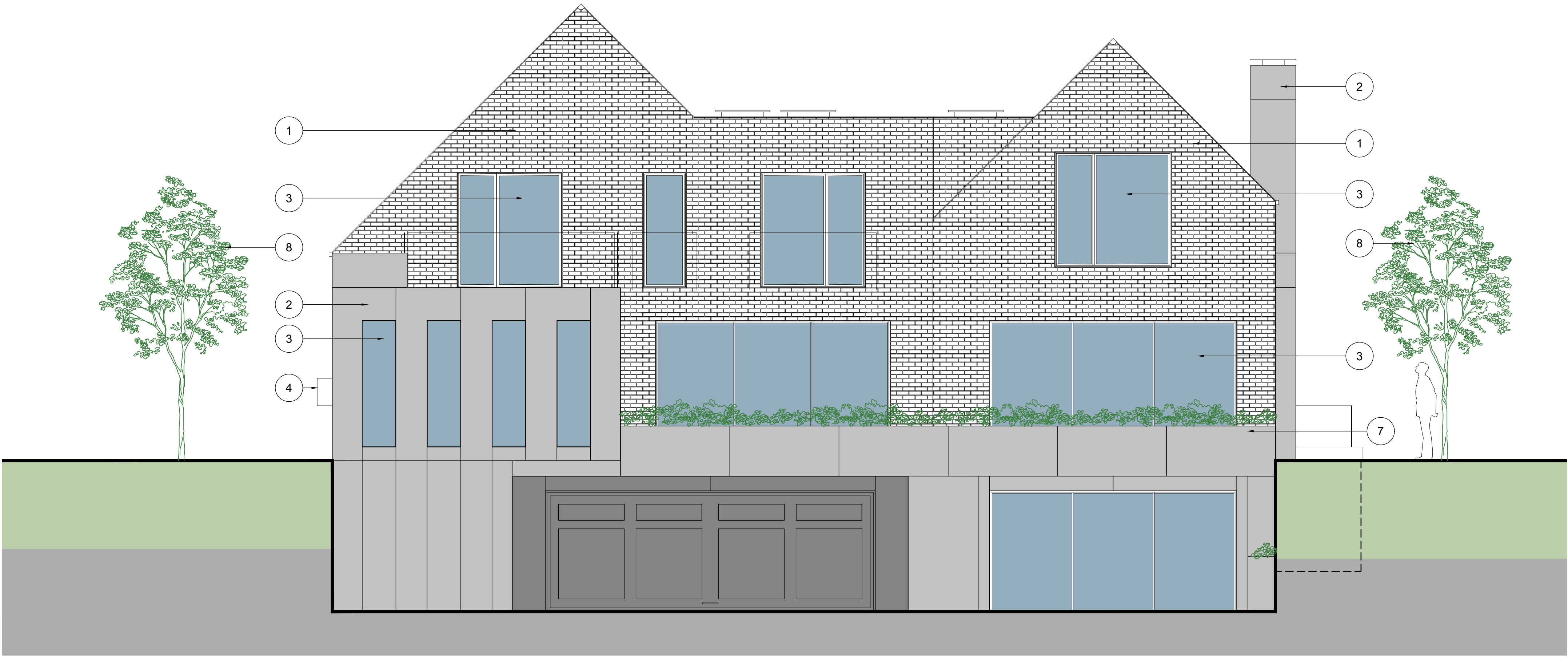
1 ELEVATION PROPOSED SOUTH ELEVATION SCALE 1: 50