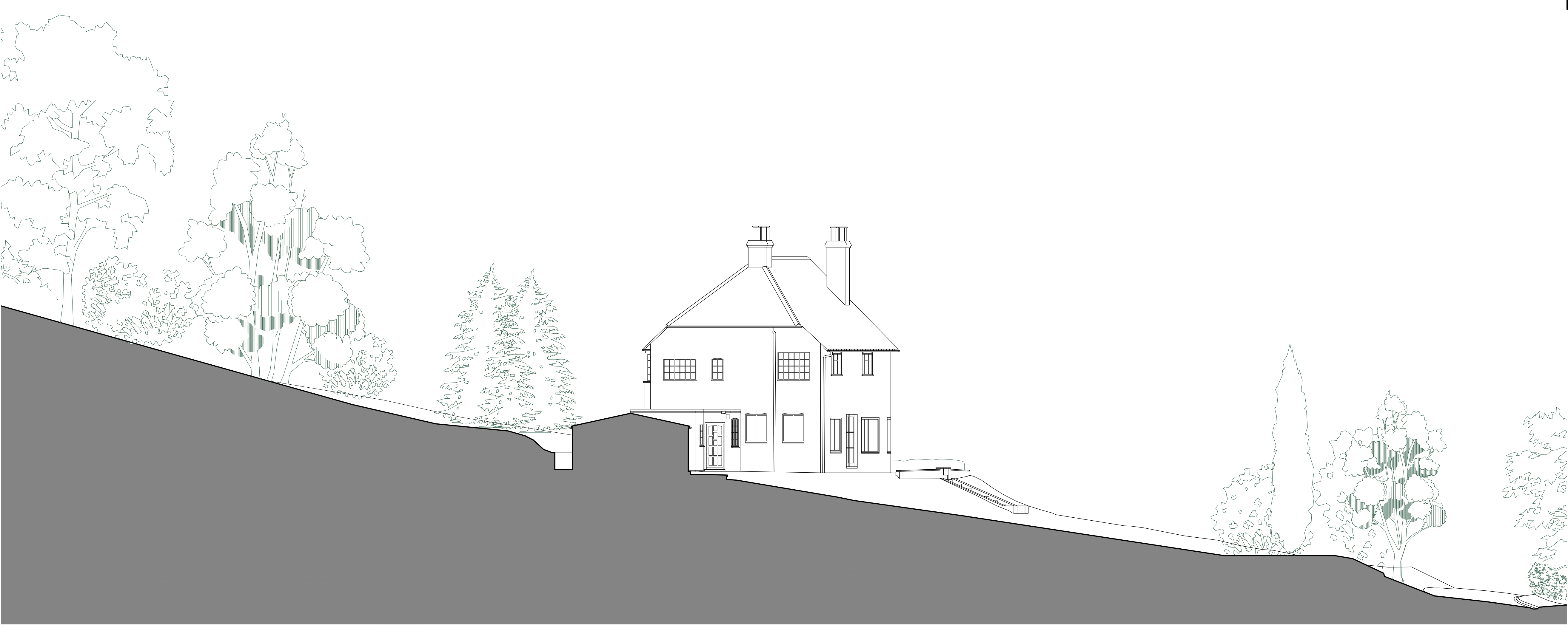
1 ELEVATION EXISTING NORTH WEST ELEVATION SCALE 1: 1:100