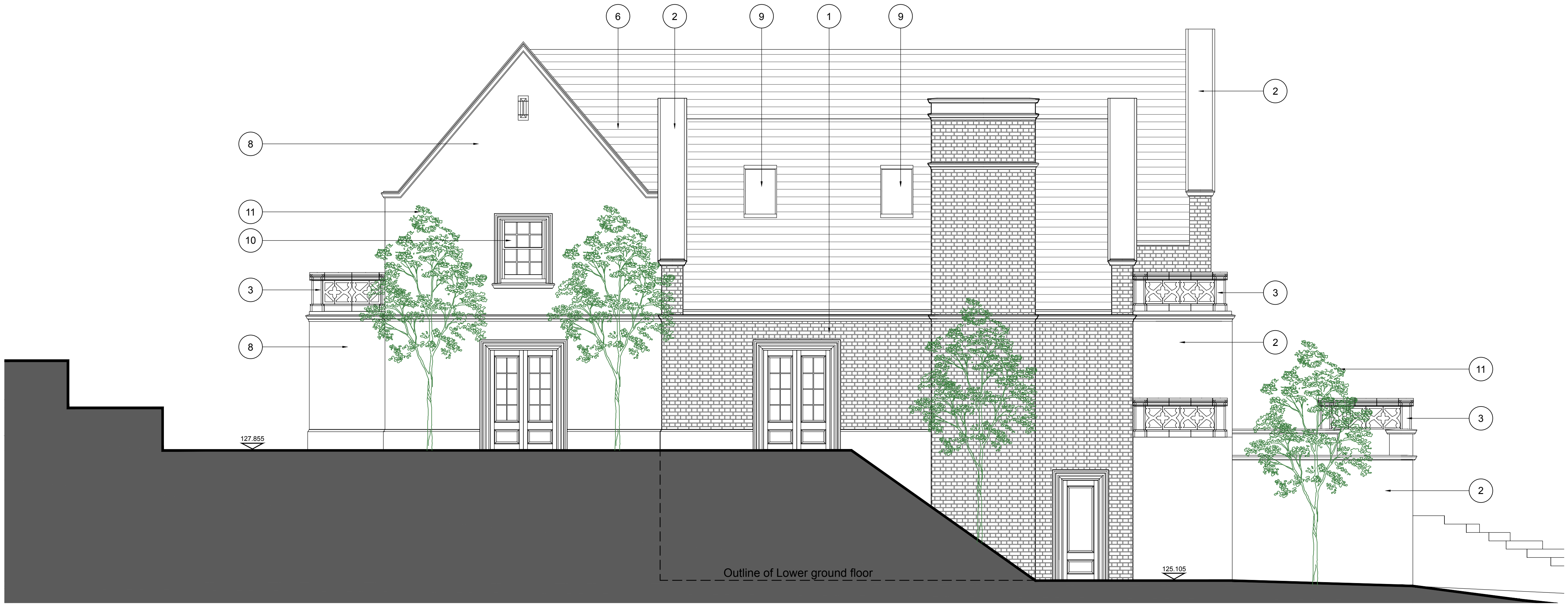
2 ELEVATION PROPOSED WEST ELEVATION SCALE 1: 1:50