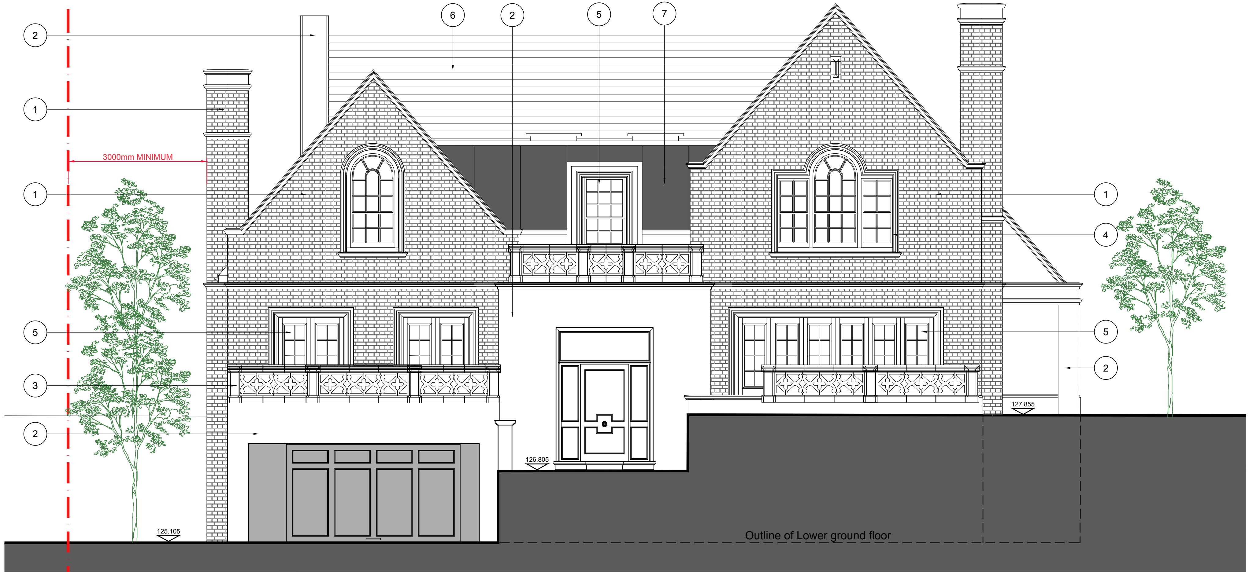
1 ELEVATION PROPOSED SOUTH ELEVATION SCALE 1: 1:50