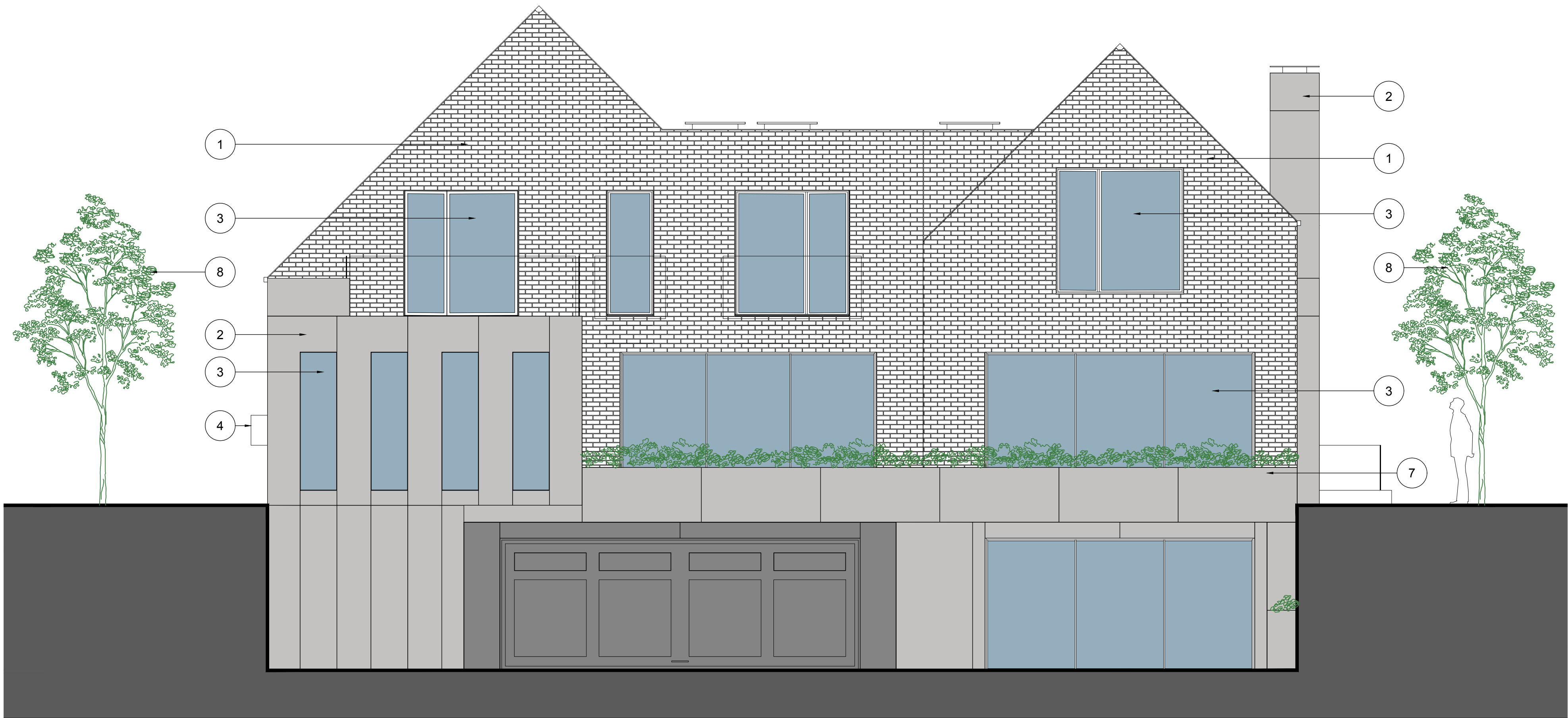
1 ELEVATION PROPOSED SOUTH ELEVATION SCALE 1: 50