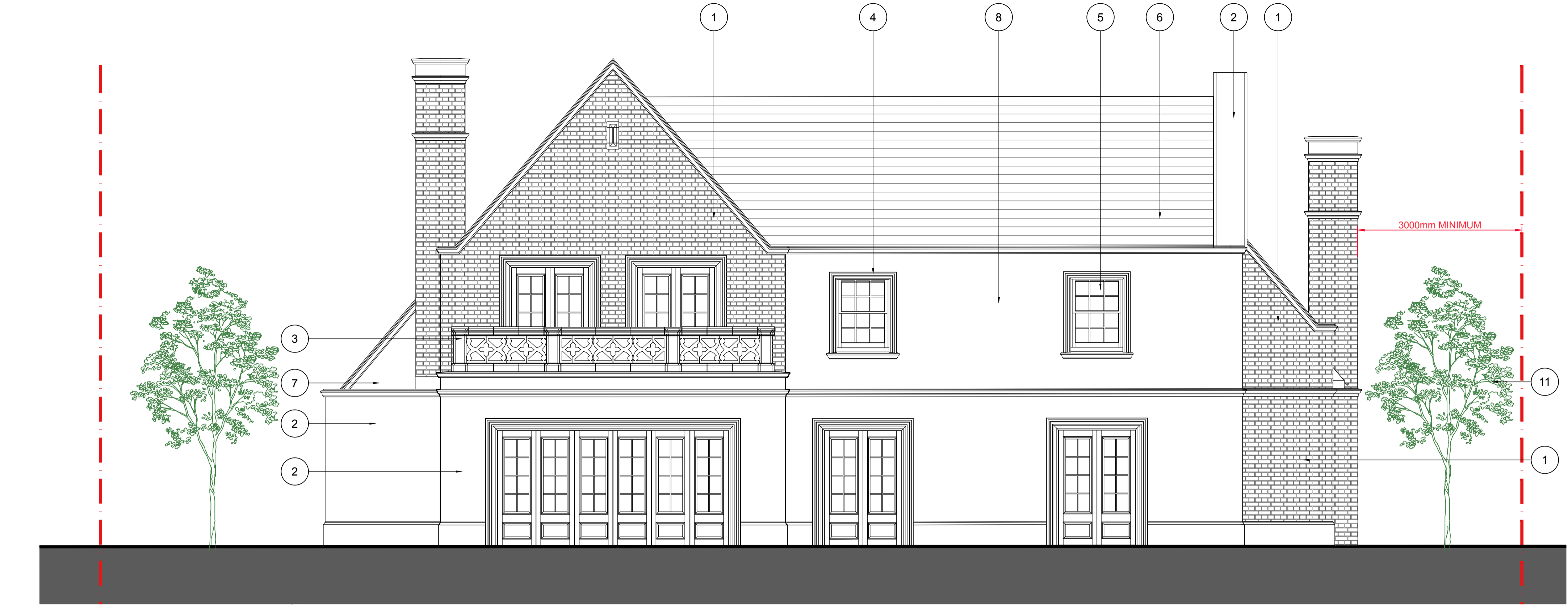
1 ELEVATION PROPOSED NORTH ELEVATION SCALE 1: 1:50