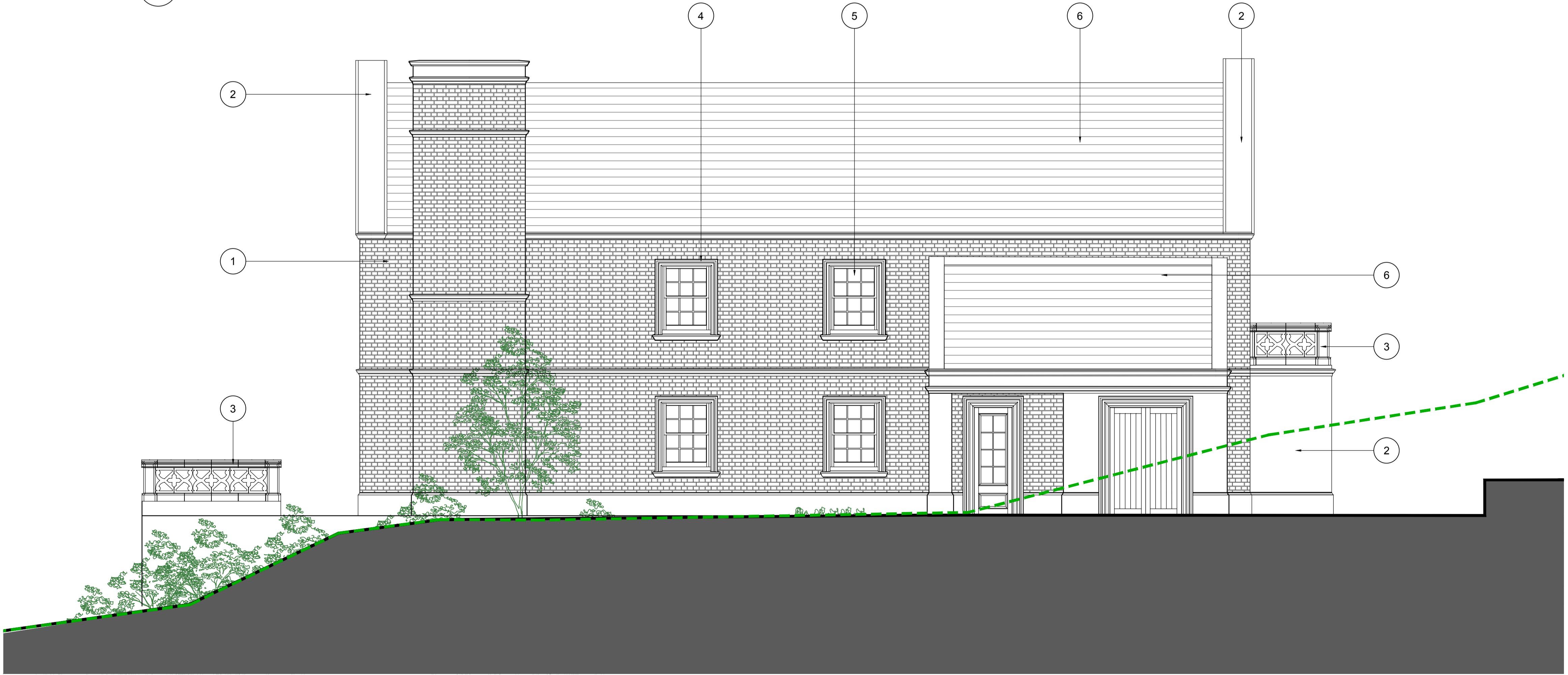
2 ELEVATION PROPOSED EAST ELEVATION SCALE 1: 1:50