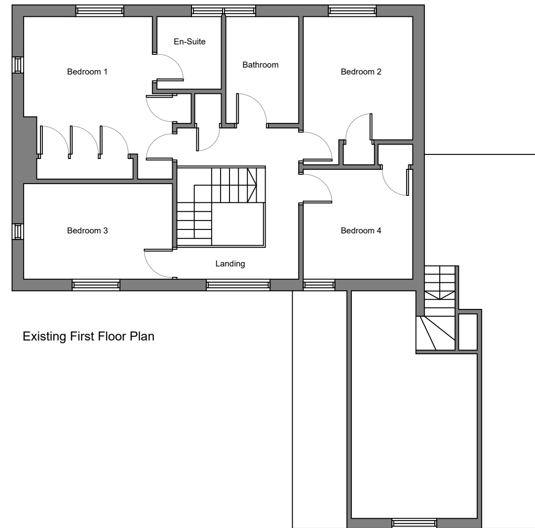
Existing First Floor Plan