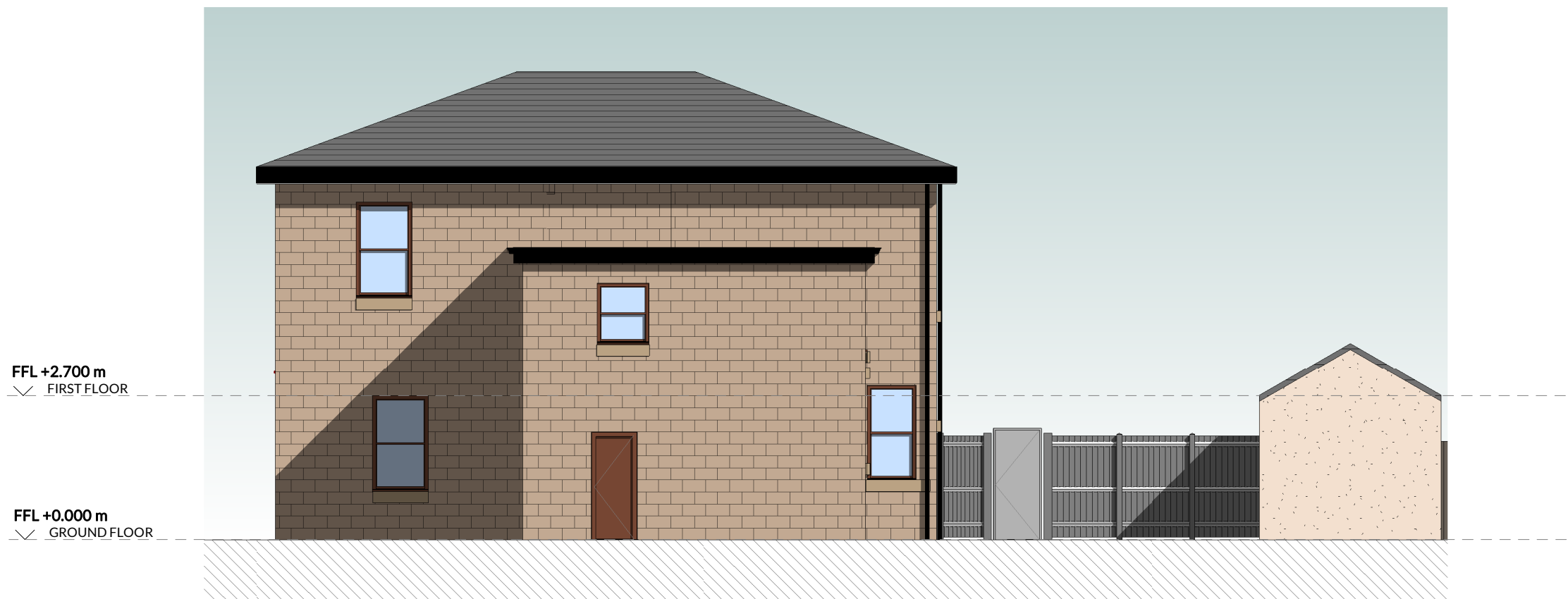
2 REAR ELEVATION - AS EXISTING 1:100