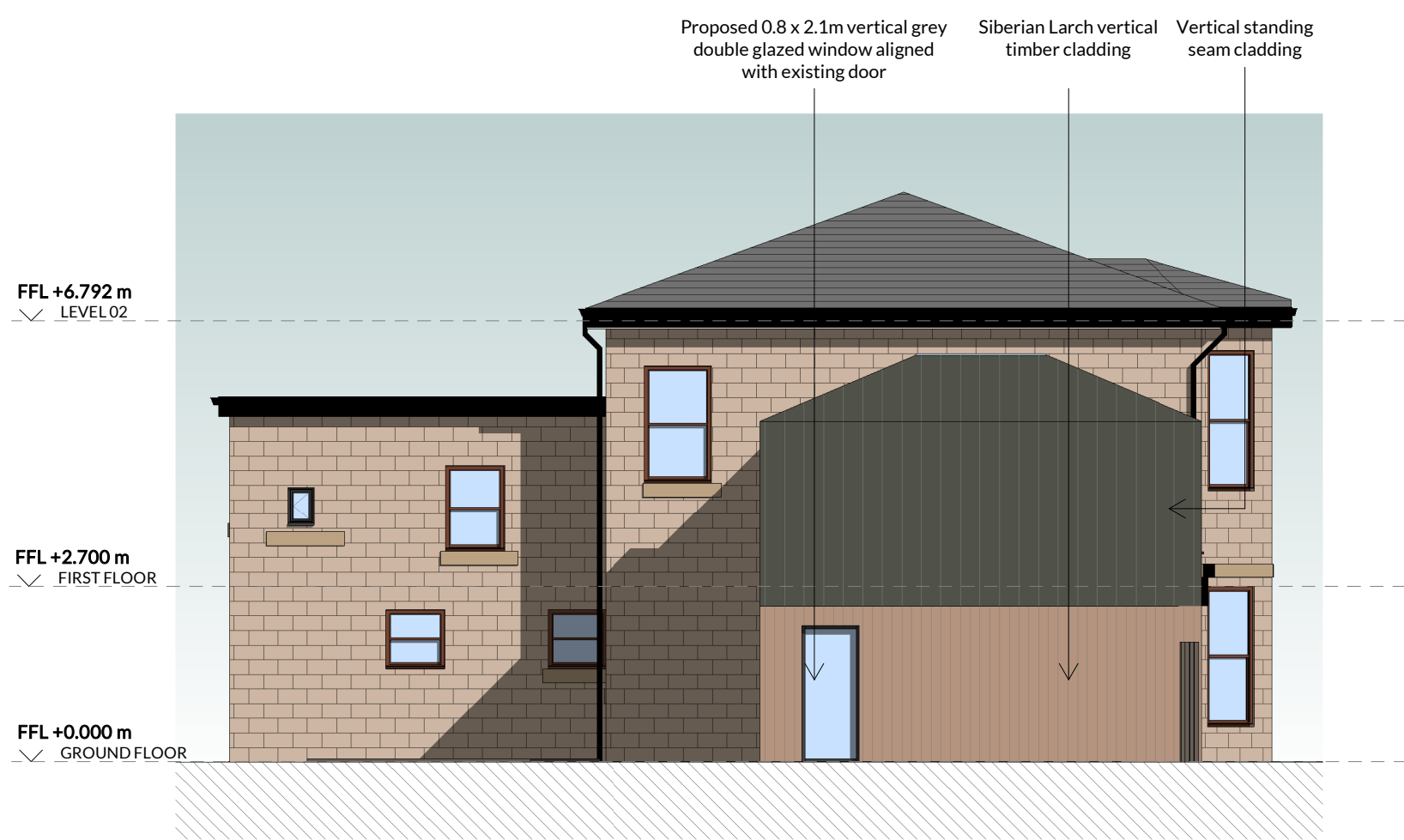
2 RIGHT ELEVATION - AS PROPOSED 1:100