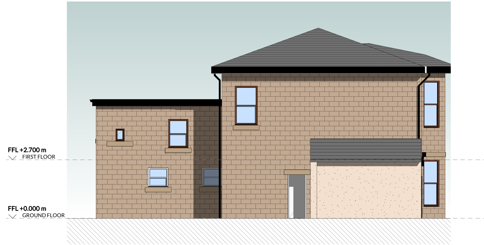
2 RIGHT ELEVATION - AS EXISTING 1:100