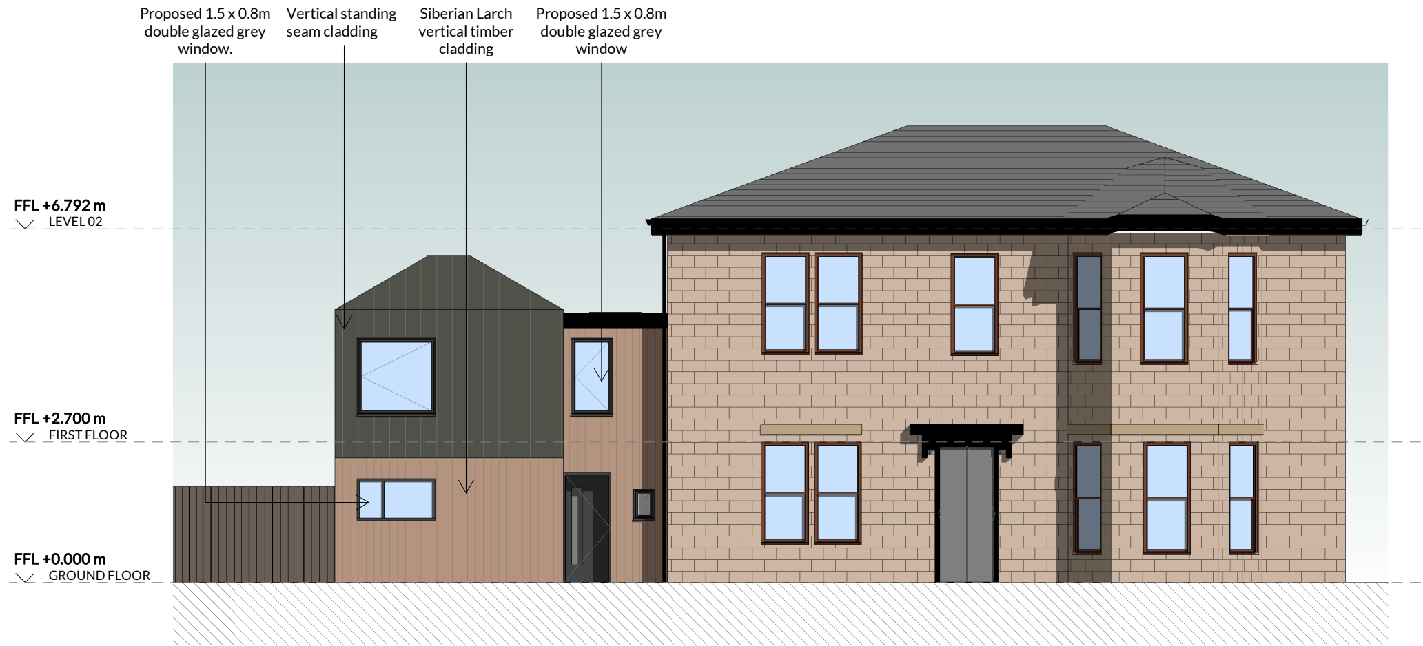
1 FRONT ELEVATION - AS PROPOSED 1:100

Do not scale from drawings. All dimensions are in millimetres unless otherwise stated. All dimensions to be verified on site before proceeding with the work. Any discrepancies to be notified in writing to Architect immediately