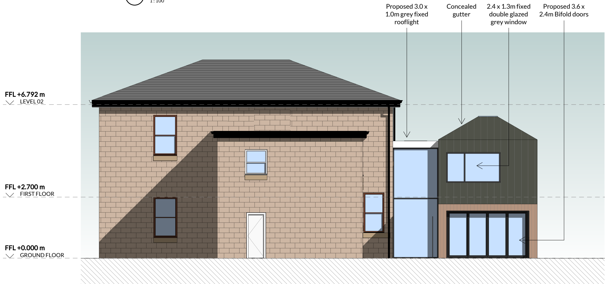
2 BACK ELEVATION - AS PROPOSED 1:100