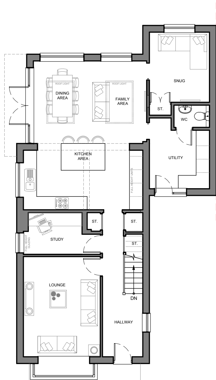
PROPOSED GROUND FLOOR PLAN E