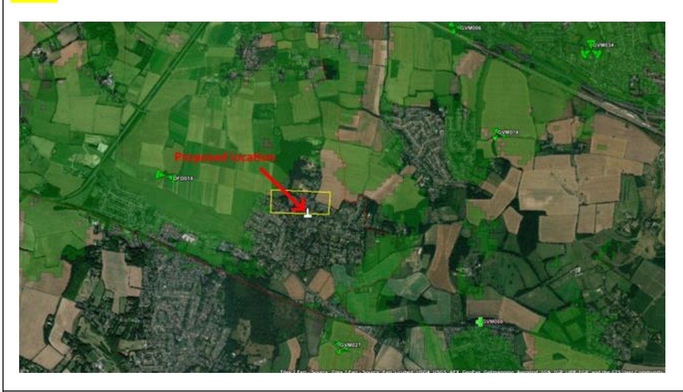
Figure 4 - Coverage Map: Proposed installation must be located close to the area shown below.

The optimum solution from the perspective of cell planning and radio coverage has been put forward. The target Search Area (shown as by the yellow outline) and existing CK Hutchison Networks (UK) Ltd sites are illustrated within Figure 4 below: