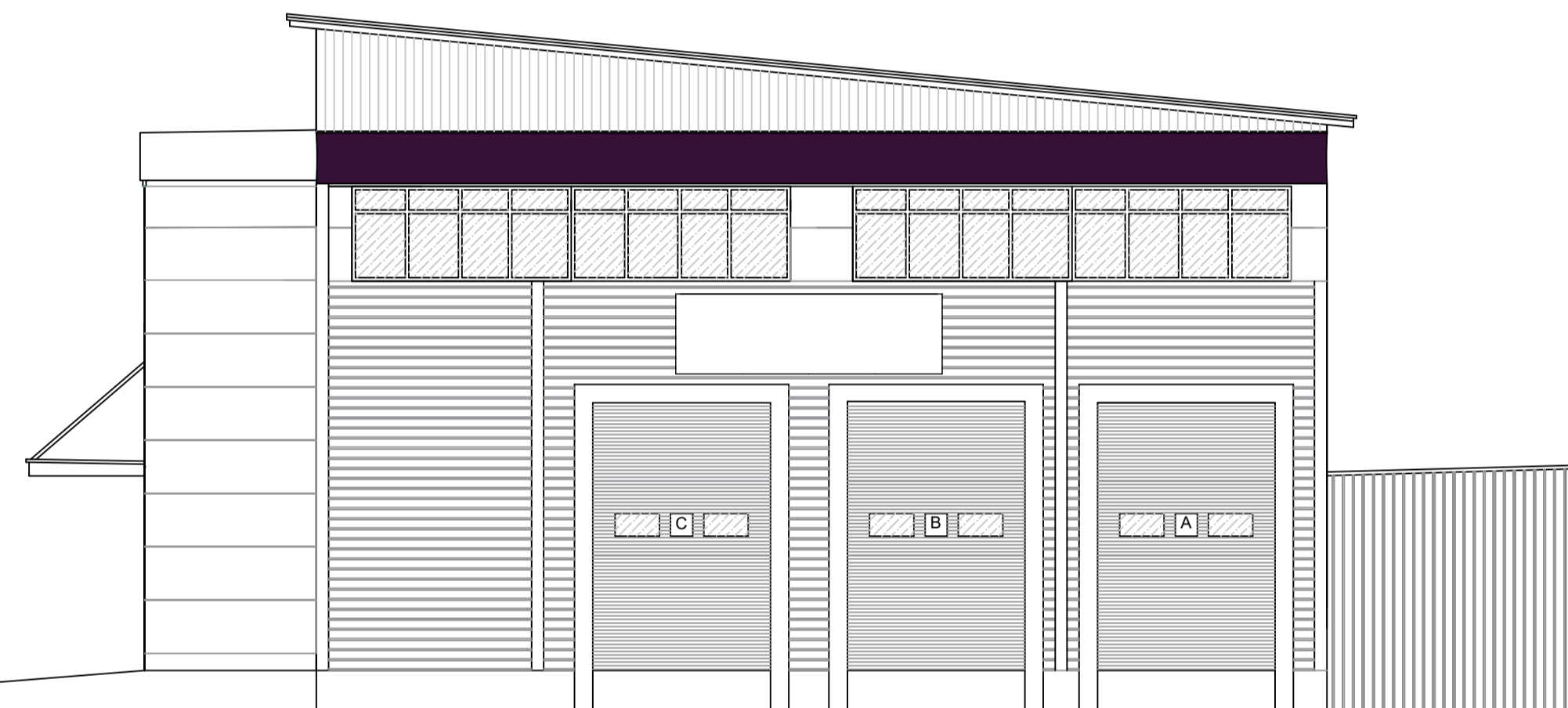
South East Elevation 1:100 @ A1