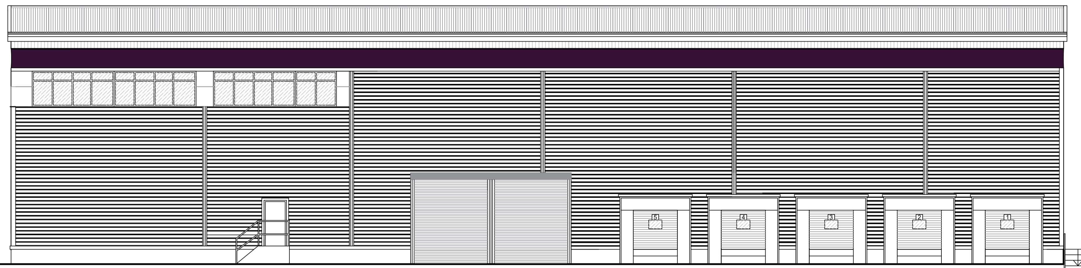
North East Elevation 1:100 @ A1