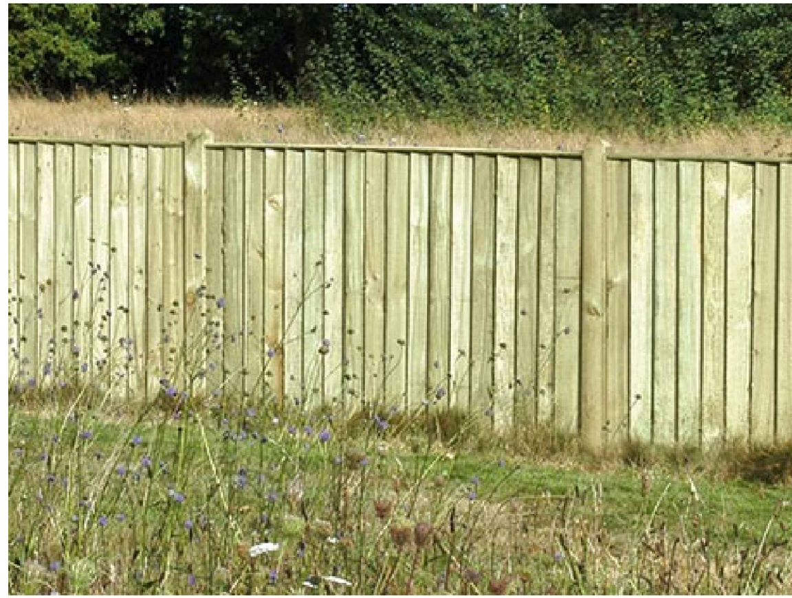
Close Boarded Timber Fence 1.2m high