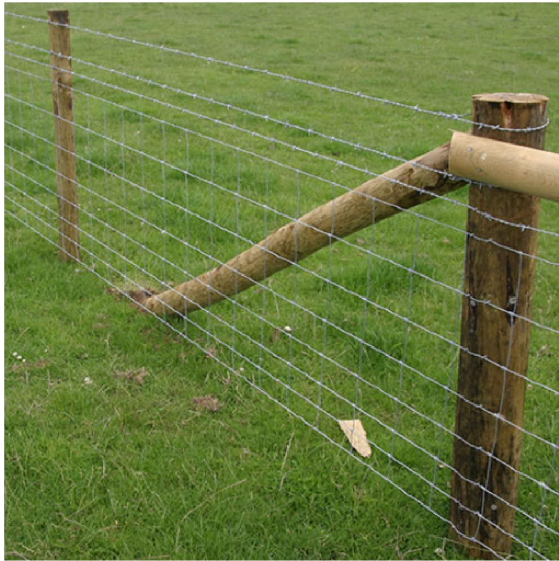
Post and Wire Mesh Fence 1.2m high