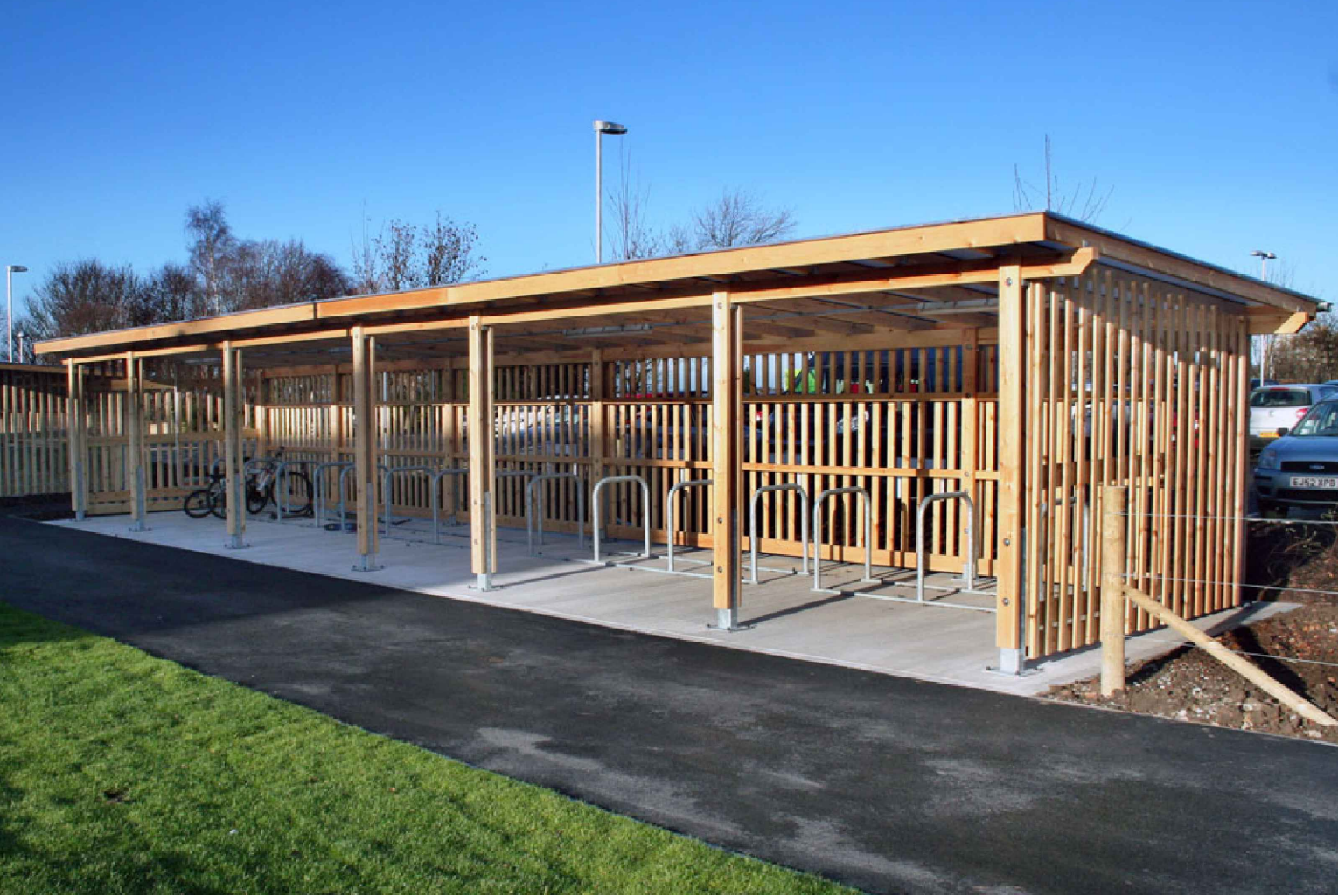
Cycle Shelter(s) Up to 80 Bicycles/Motorcycles