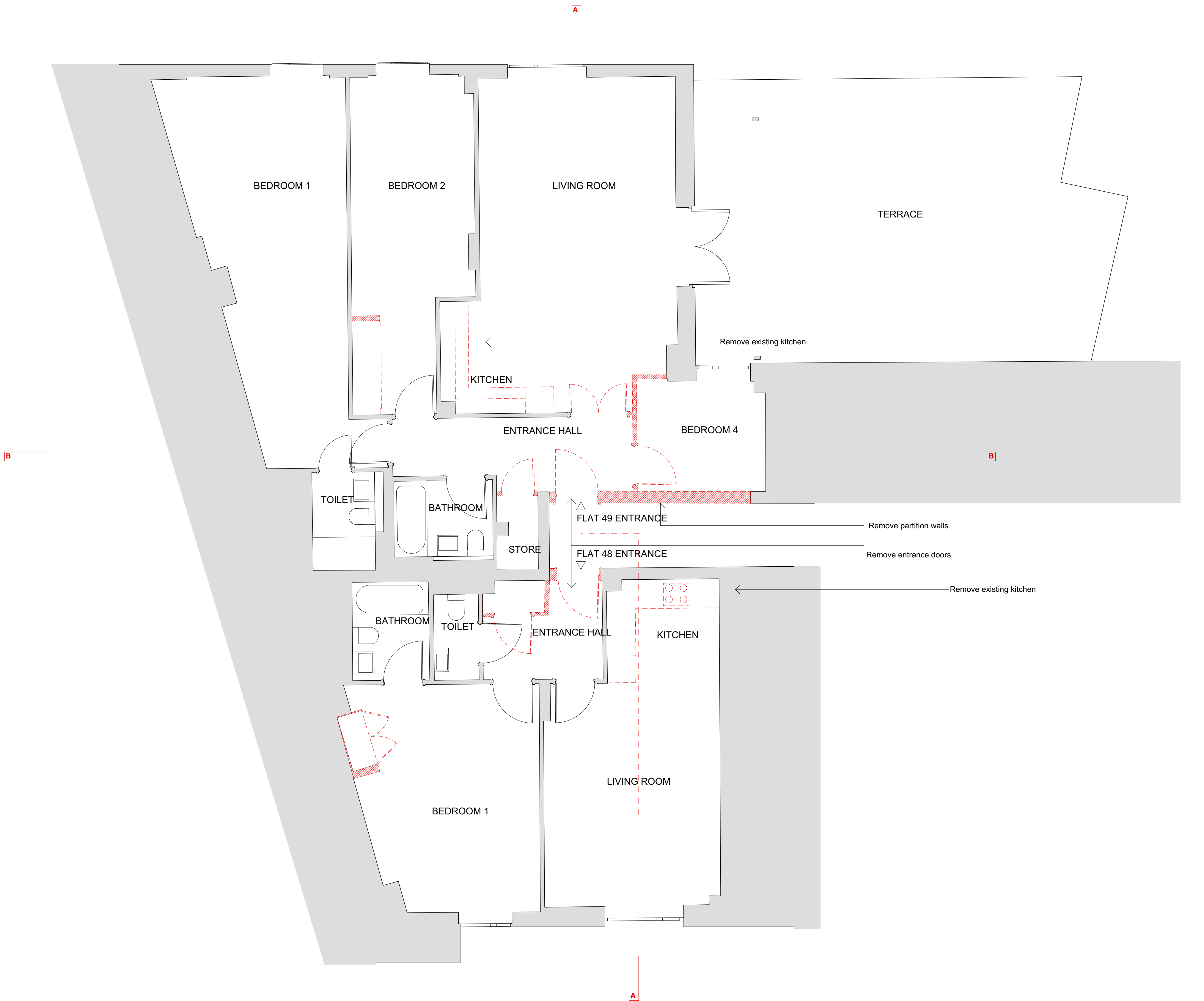
FLOOR PLAN AS DEMOLITION