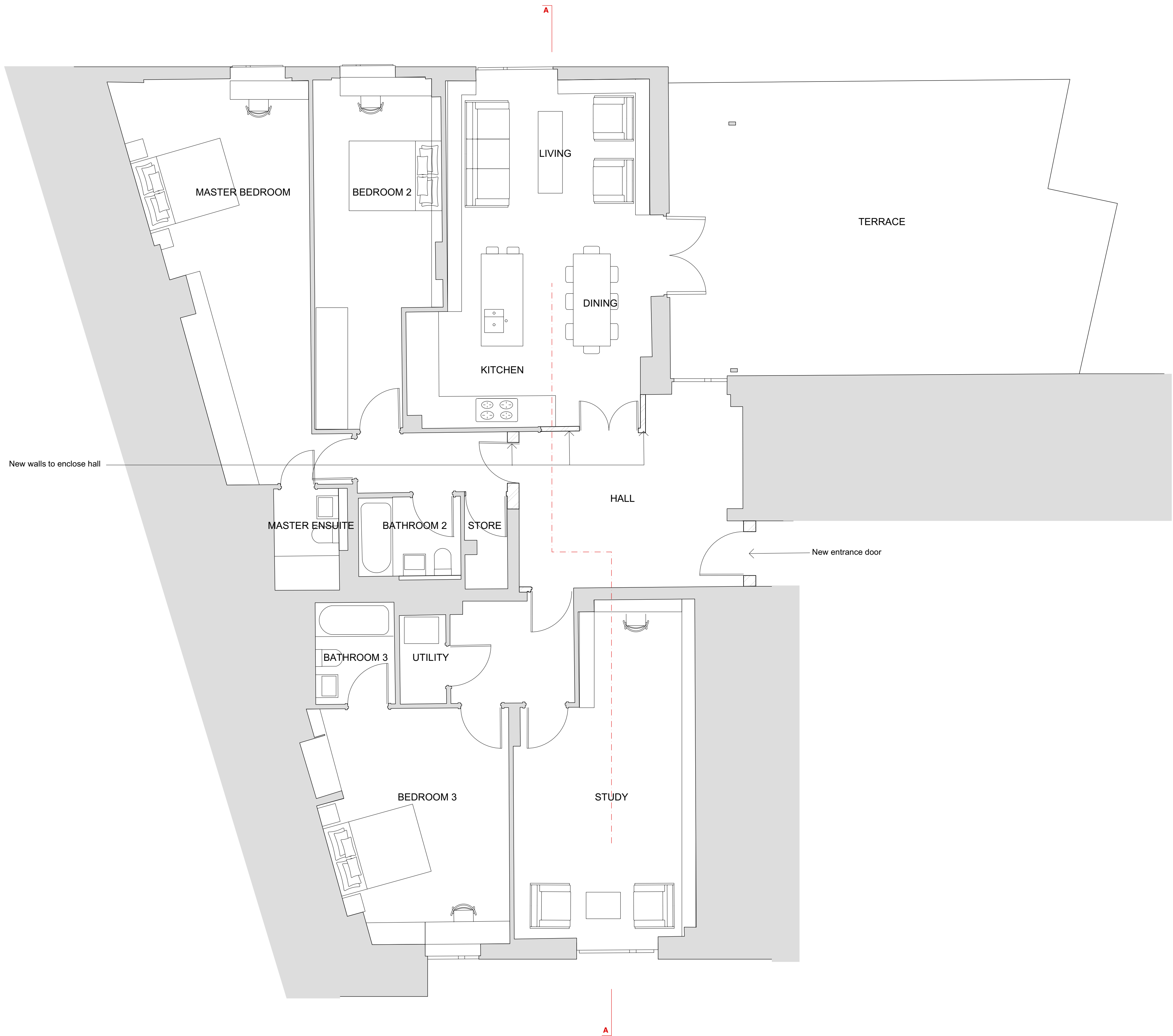
FLOOR PLAN AS PROPOSED