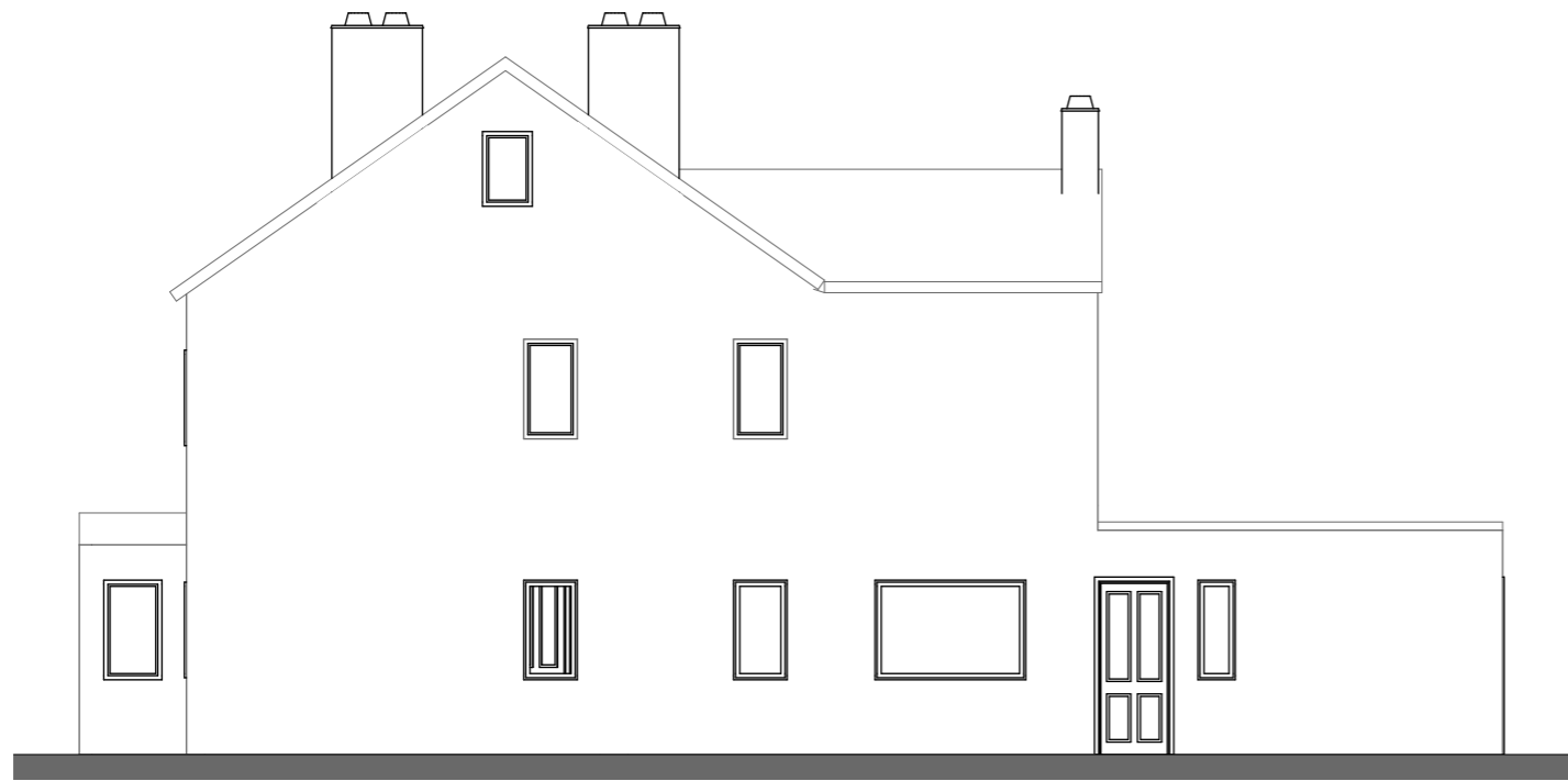
1 Open Side Elevation 1:100