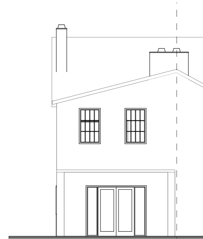
2 Rear Elevation 1:100