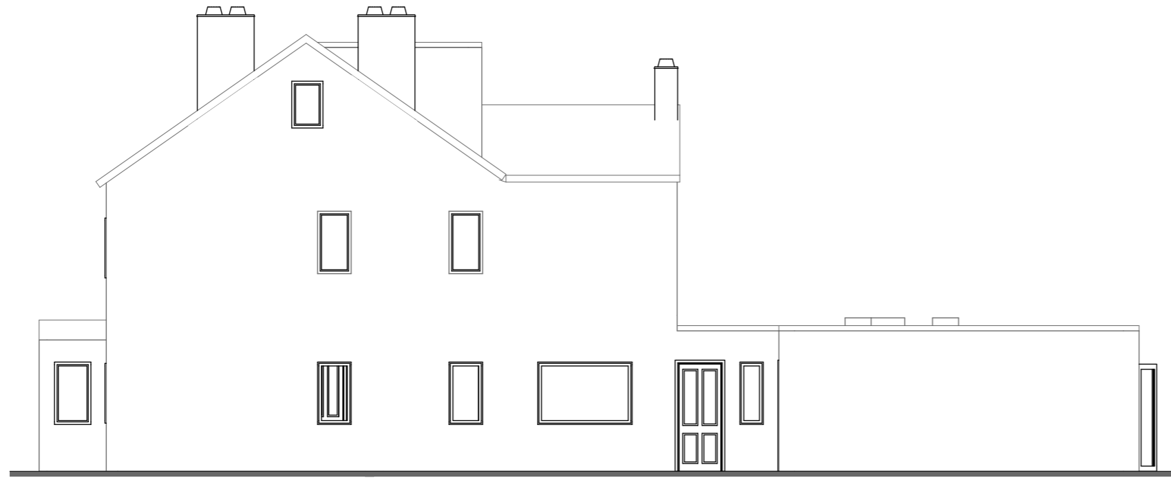
1 Open Side Elevation 1:100