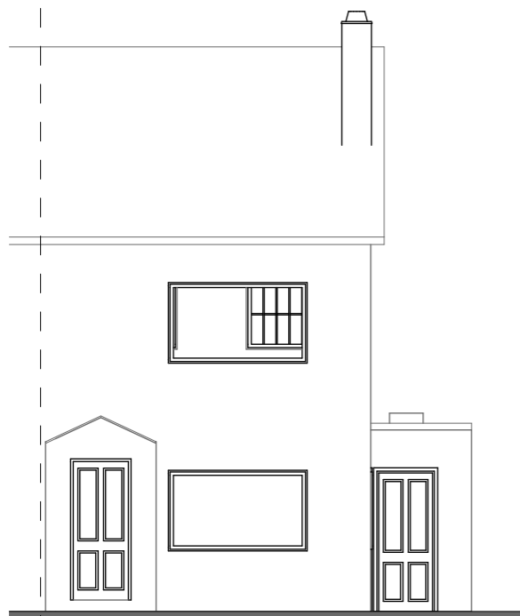
3 Front Elevation 1:100