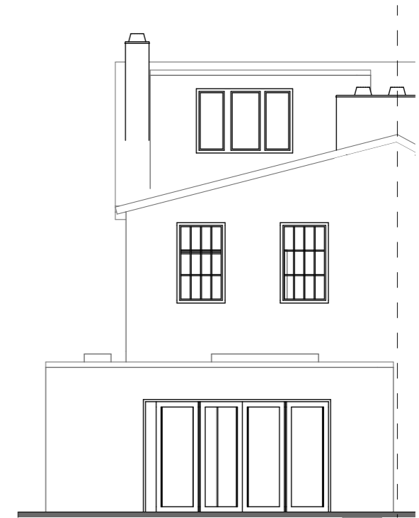
2 Rear Elevation 1:100