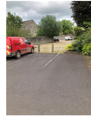
Site Photo 01. View east of proposed car wash exit viewed from car park.