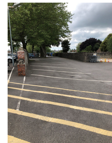
Site Photo 02. View west of proposed car washing area, viewed from car park.