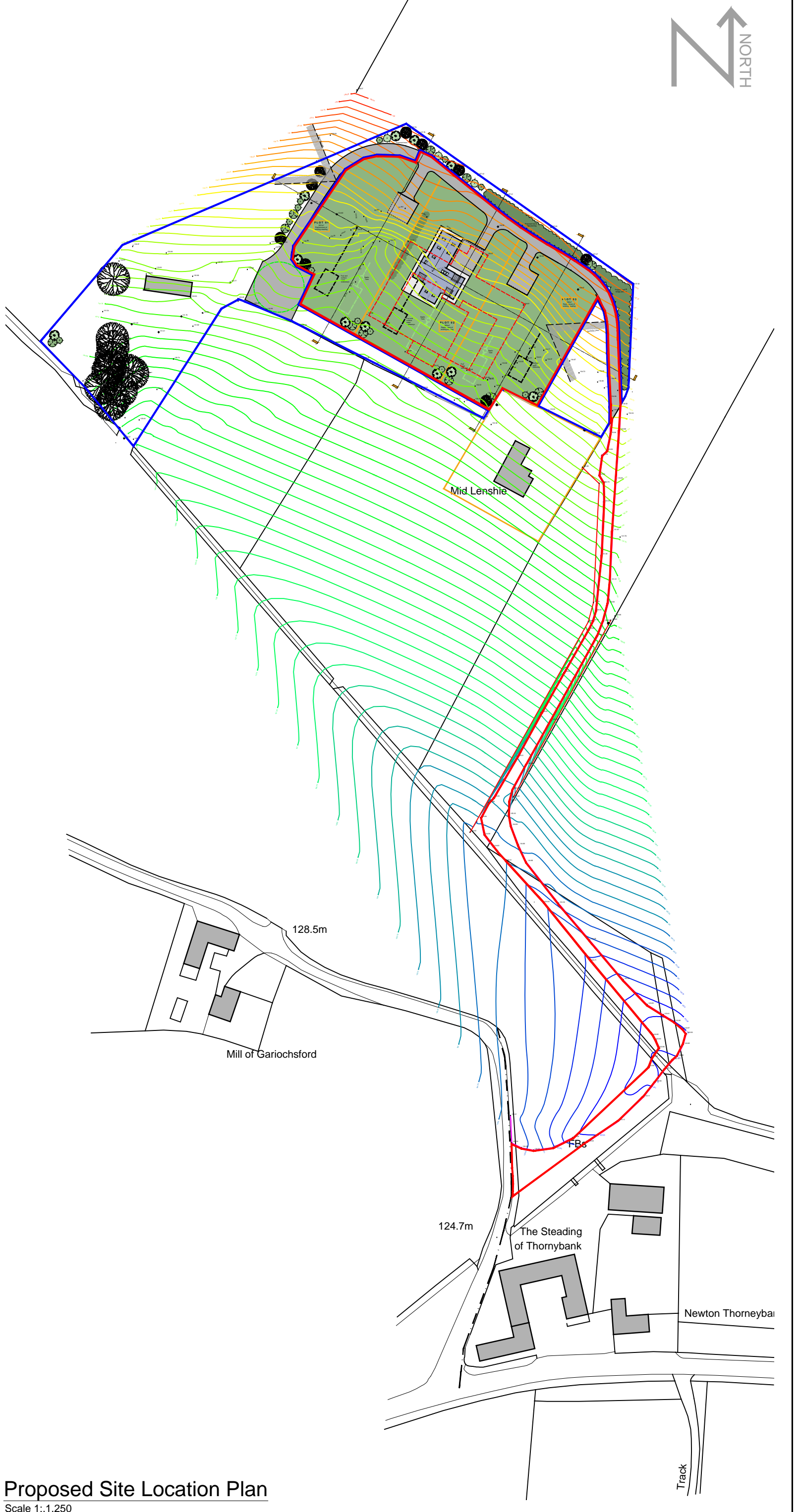
Proposed Site Location Plan Scale 1:1,250