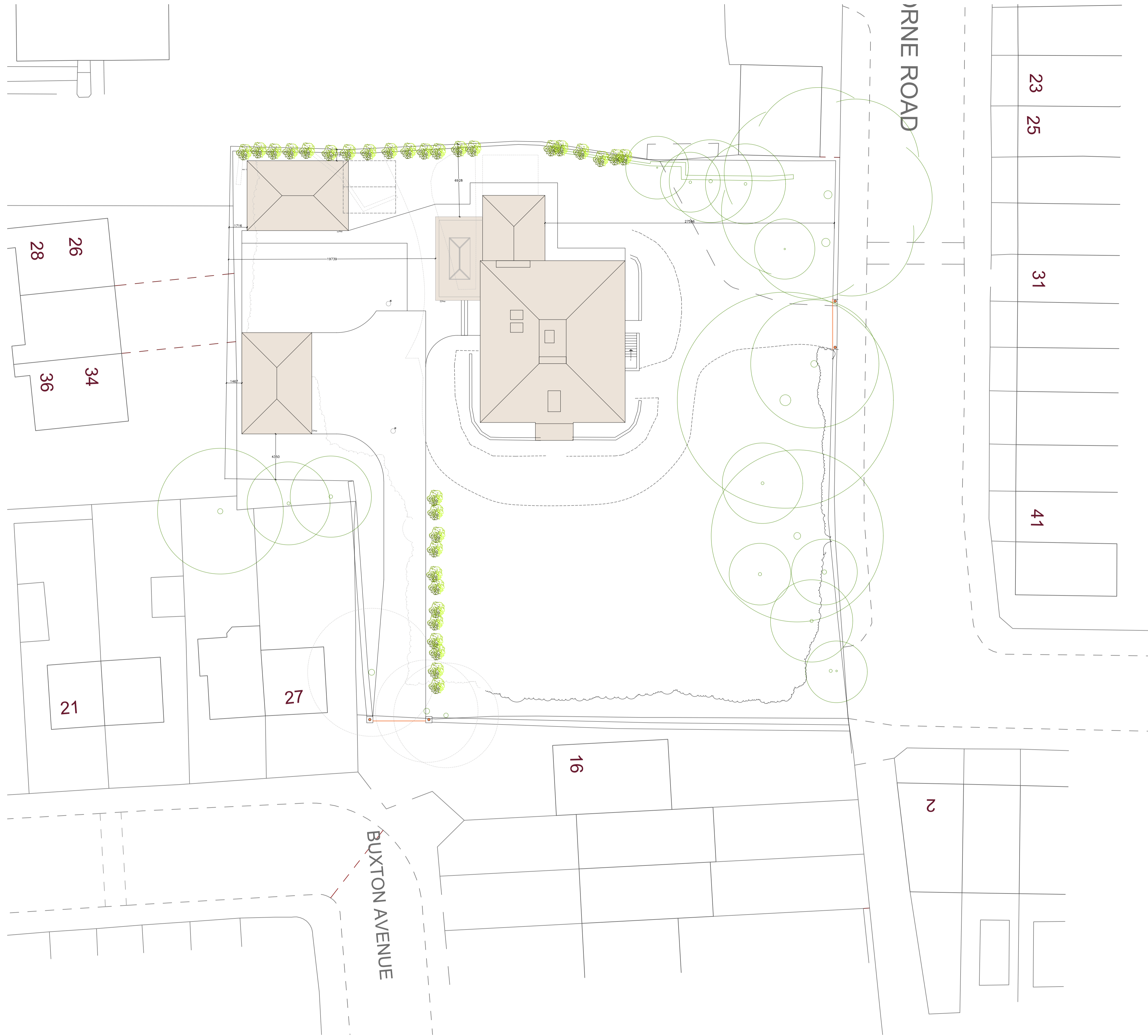
Site Plan 1:200