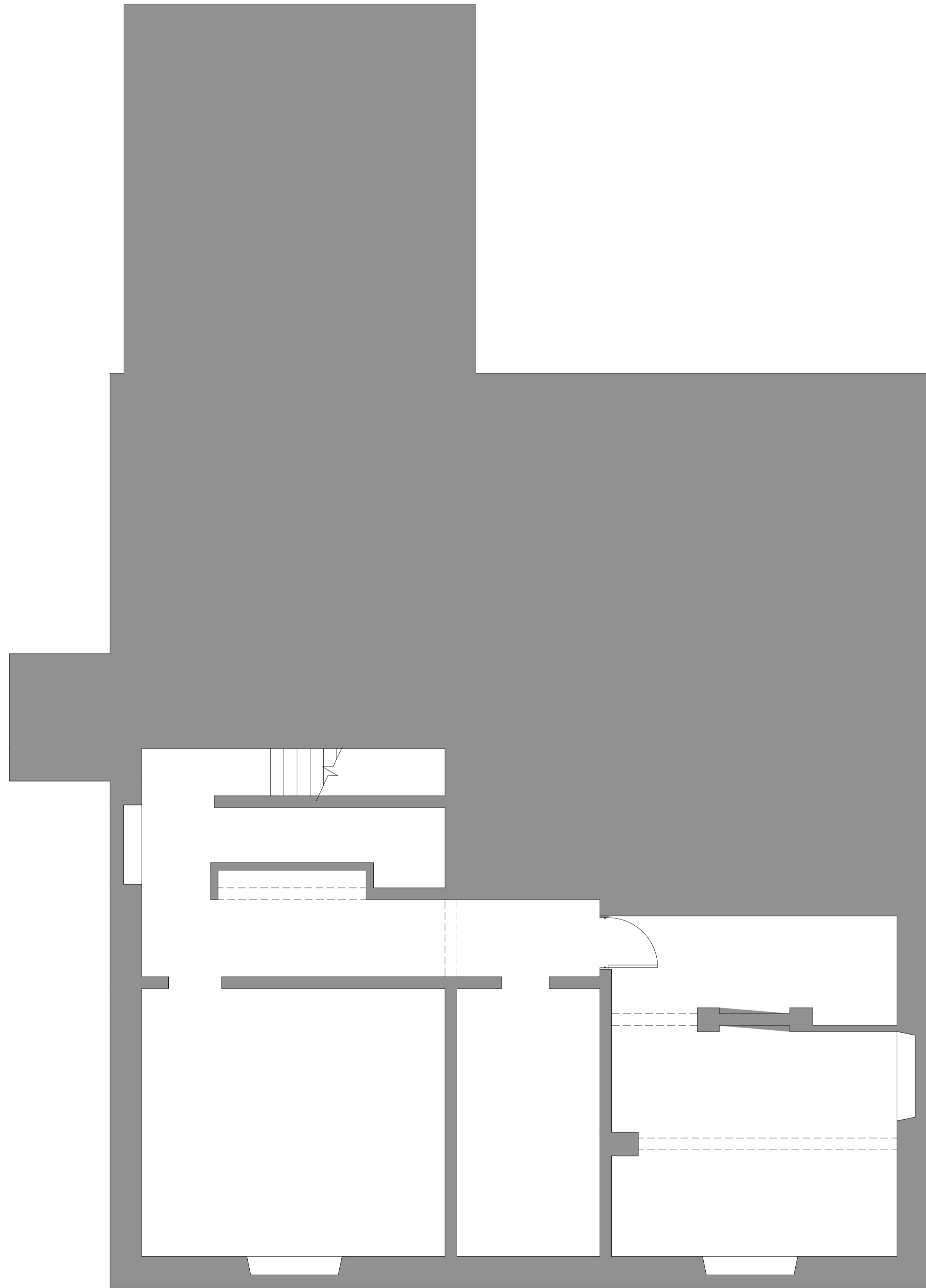
Basement Floor Plan 1:50