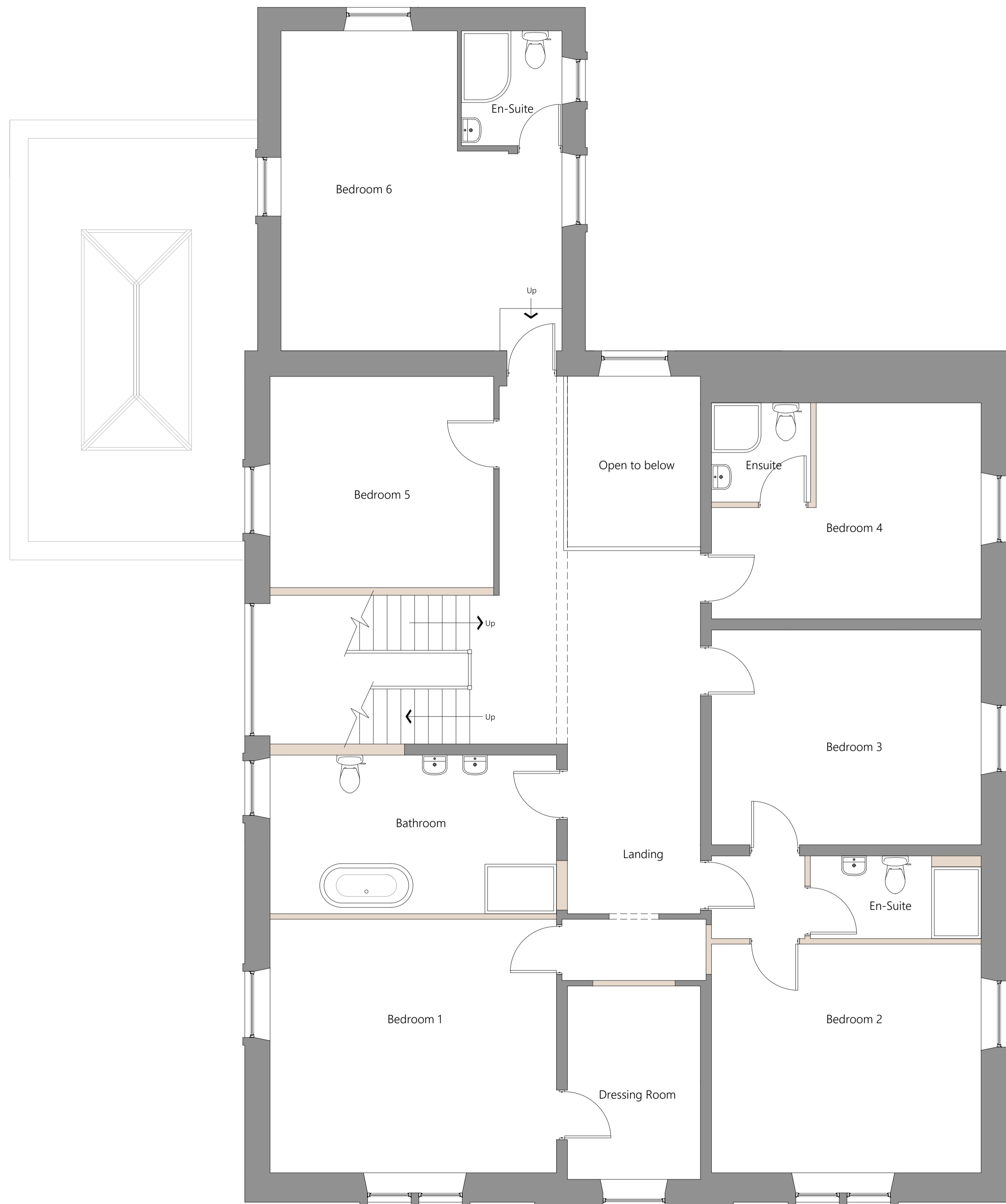
First Floor Plan 1:50