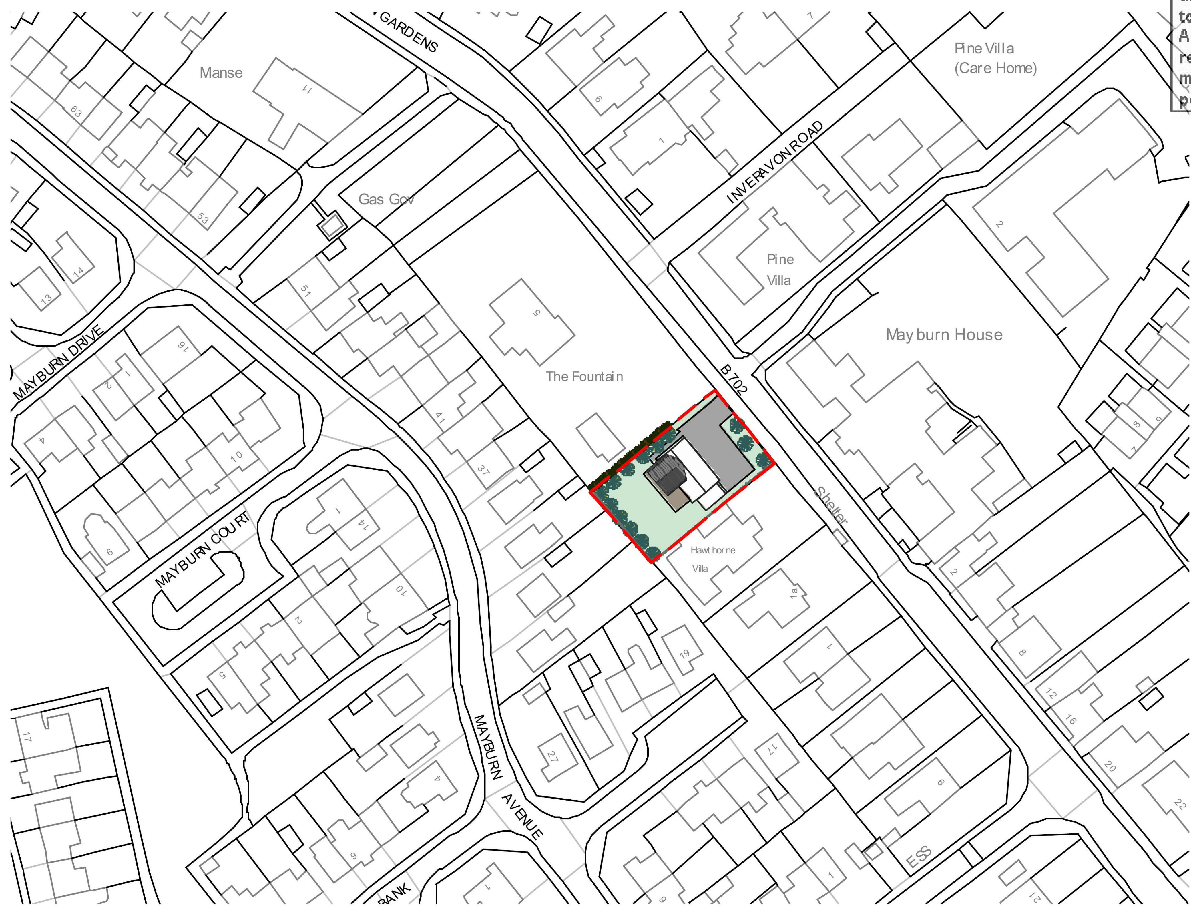
Location Plan 1:500