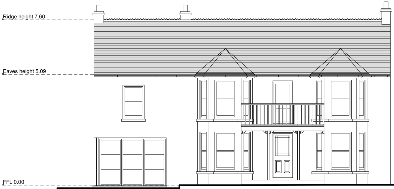
EXISTING EAST ELEVATION 1:100