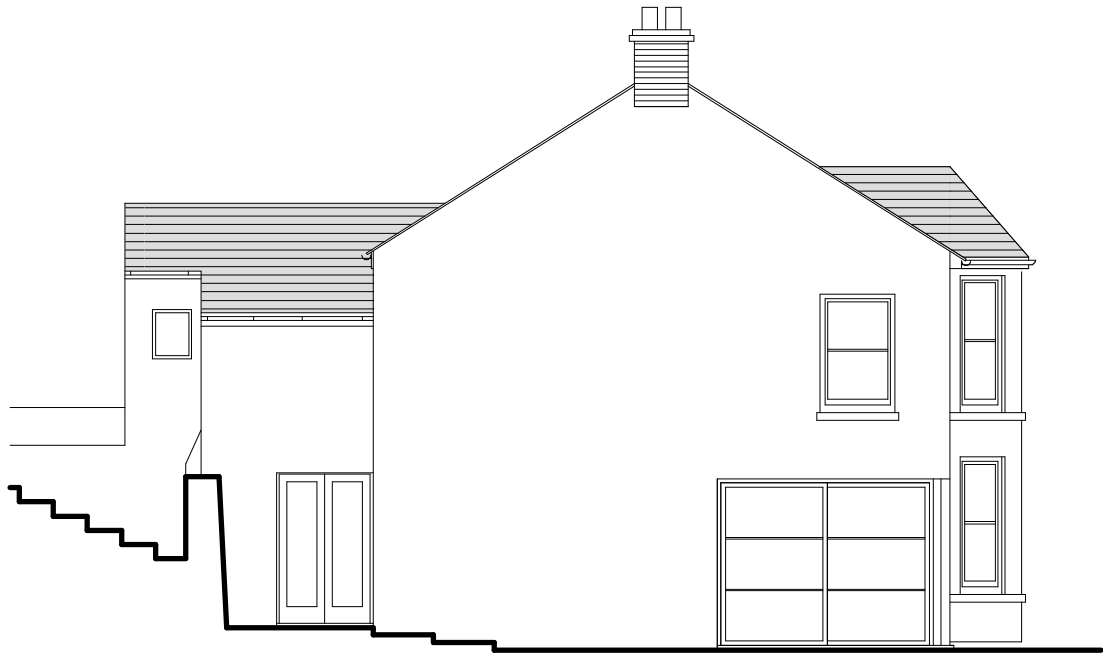
EXISTING SOUTH ELEVATION 1:100