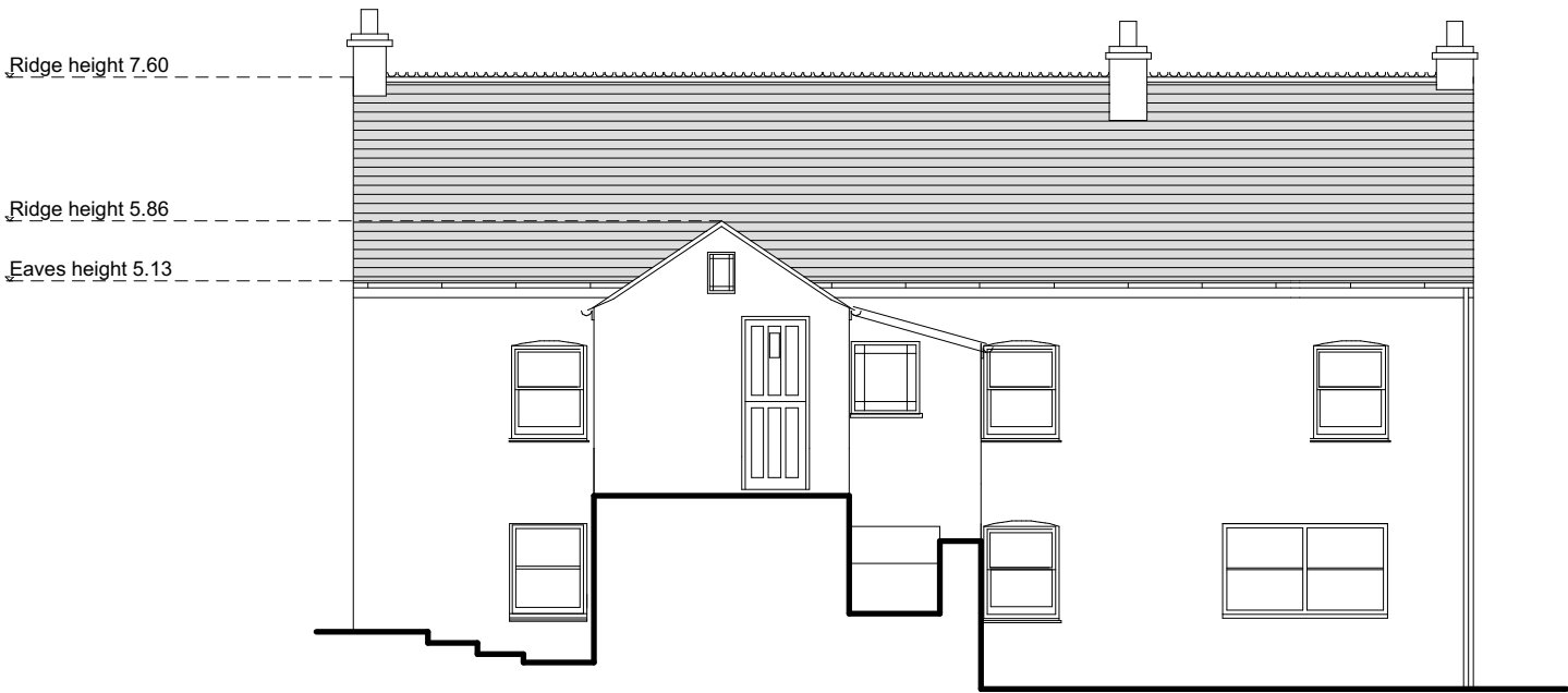
EXISTING WEST ELEVATION 1:100