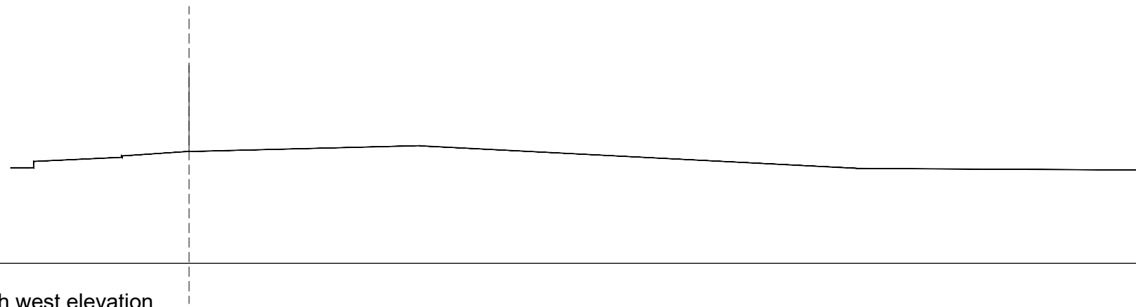
existing north west elevation