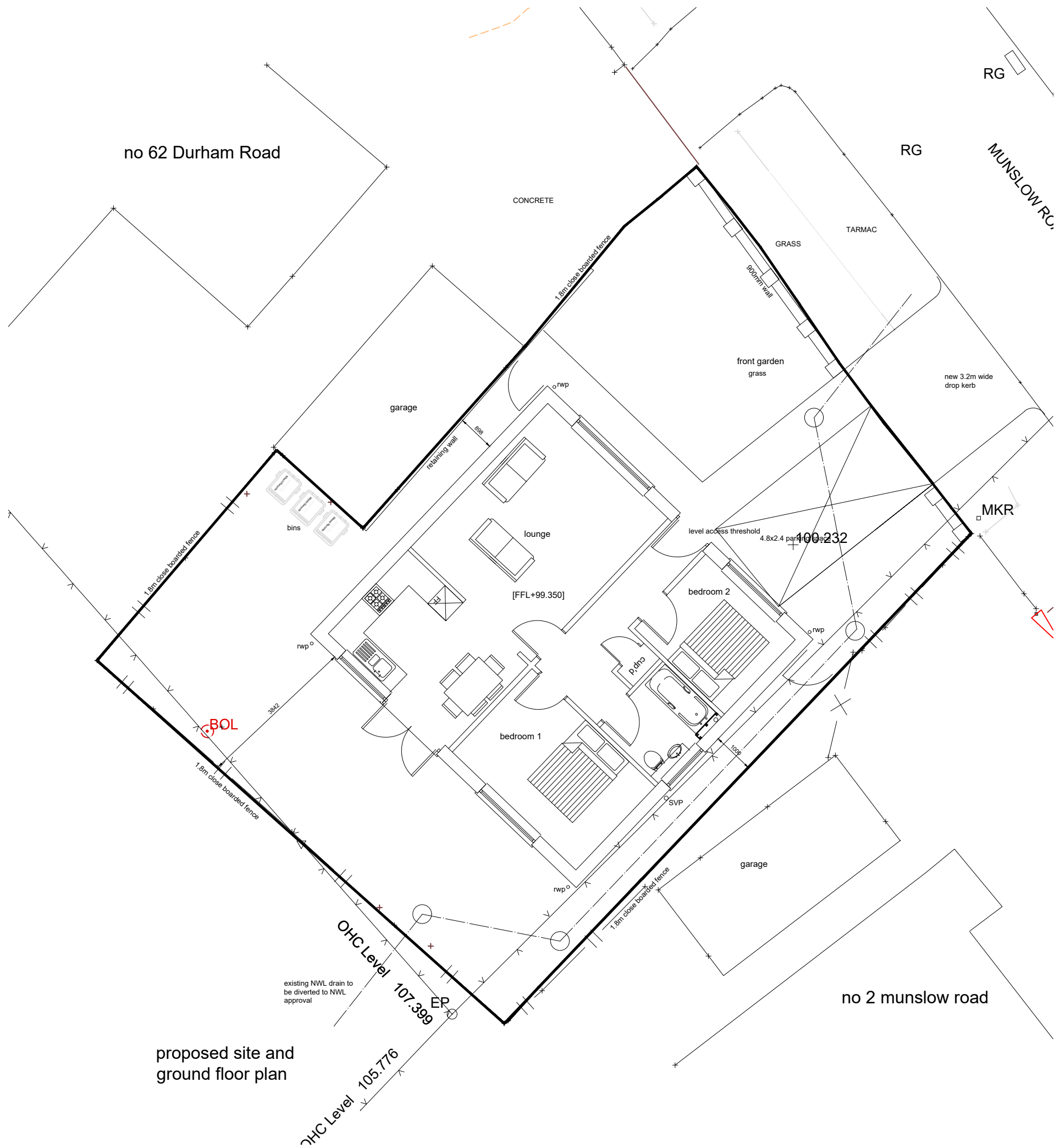
proposed site and ground floor plan