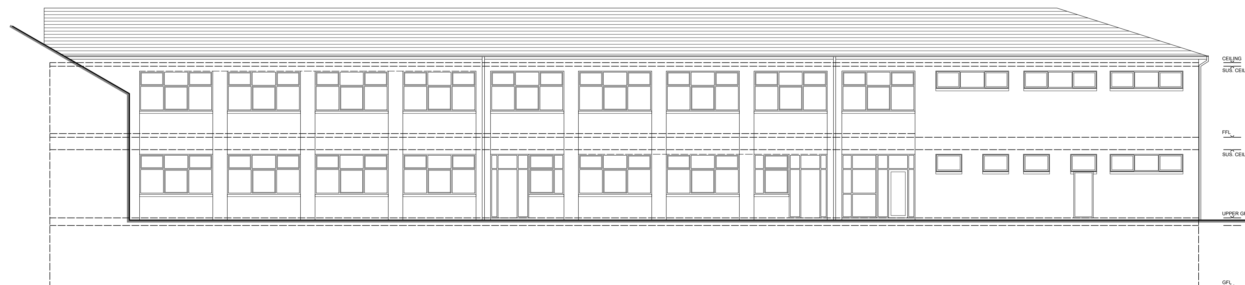
4 PROPOSED WEST ELEVATION SCALE - 1:100 @ A1