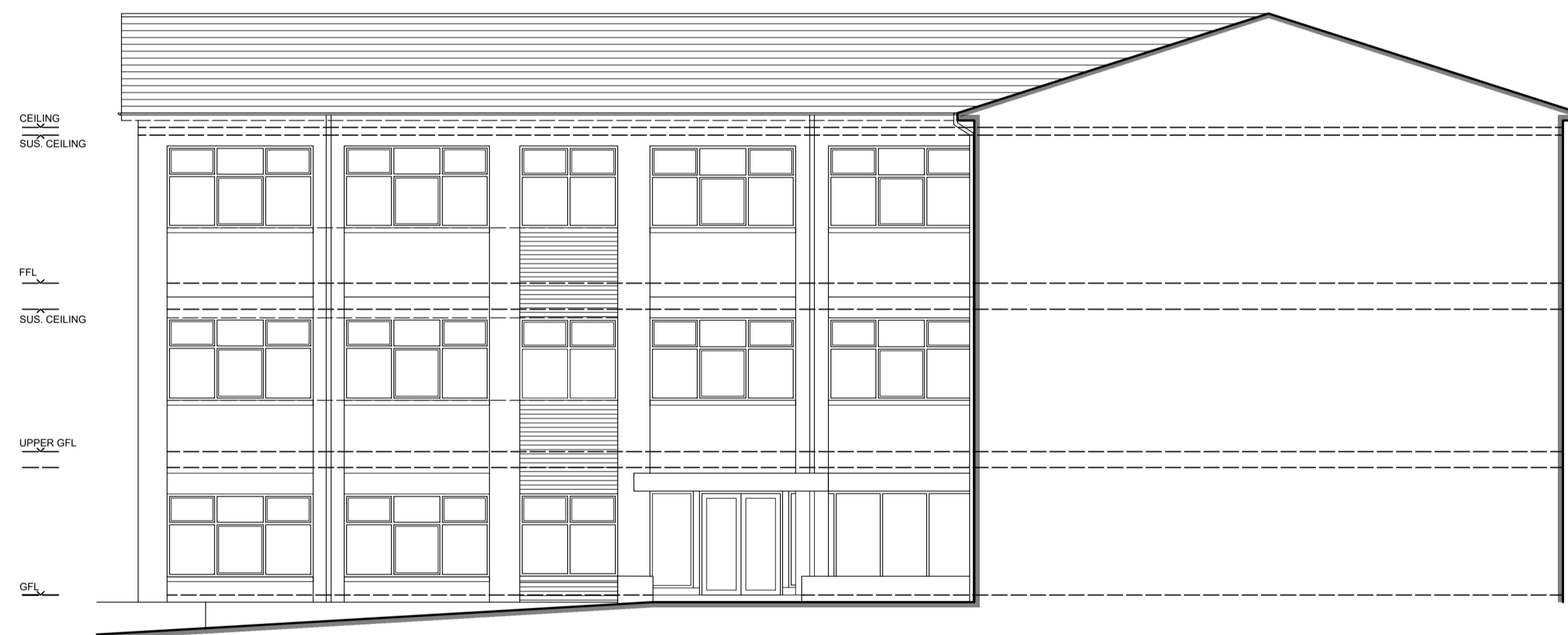
2 PROPOSED NORTH ELEVATION SCALE - 1:100 @ A1