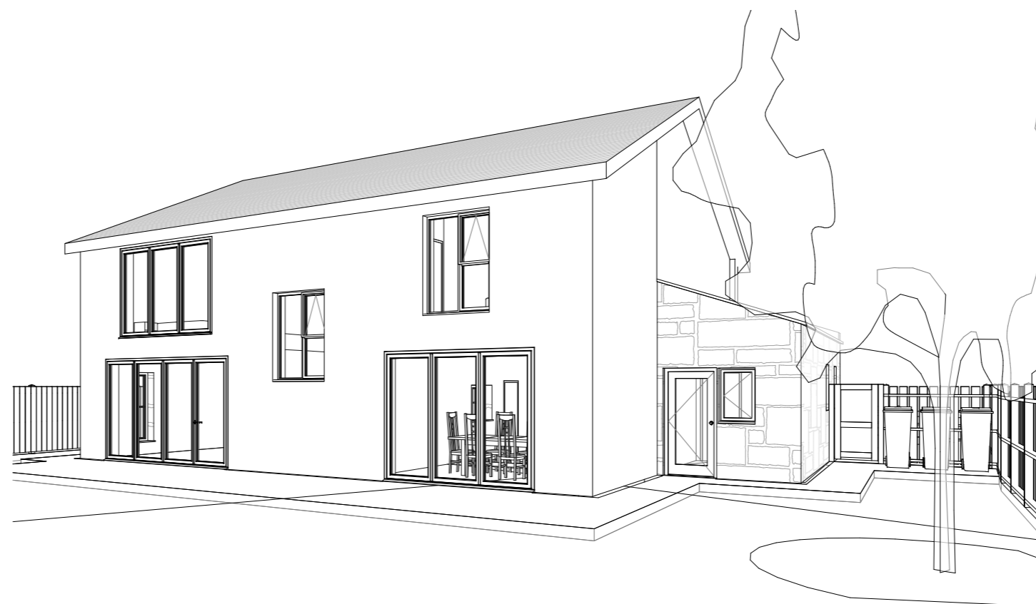
3 | Rear garden view SCALE