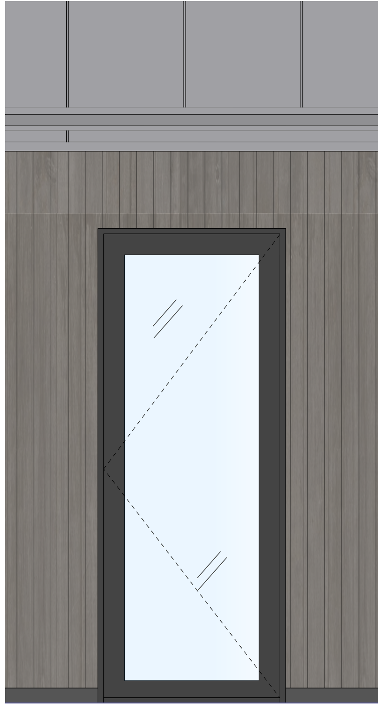
GF.02.D2 KITCHEN CORRIDOR