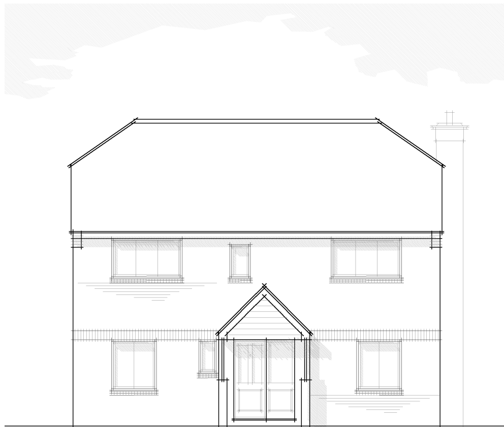
EXISTING FRONT ELEVATION (facing due west) SCALE 1:100