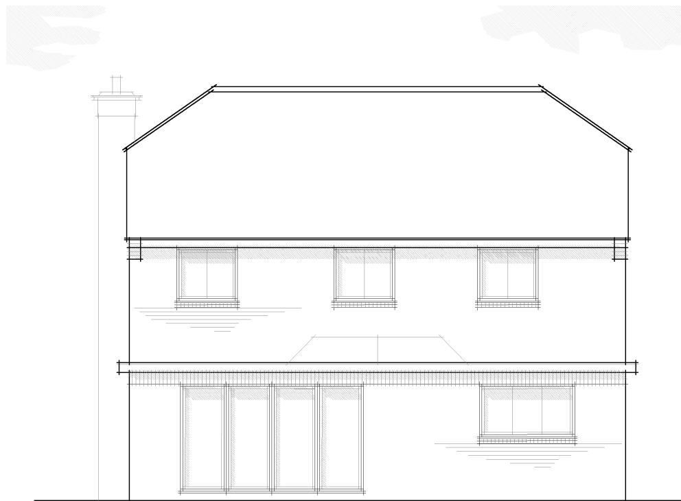
EXISTING REAR ELEVATION (facing due east) SCALE 1:100