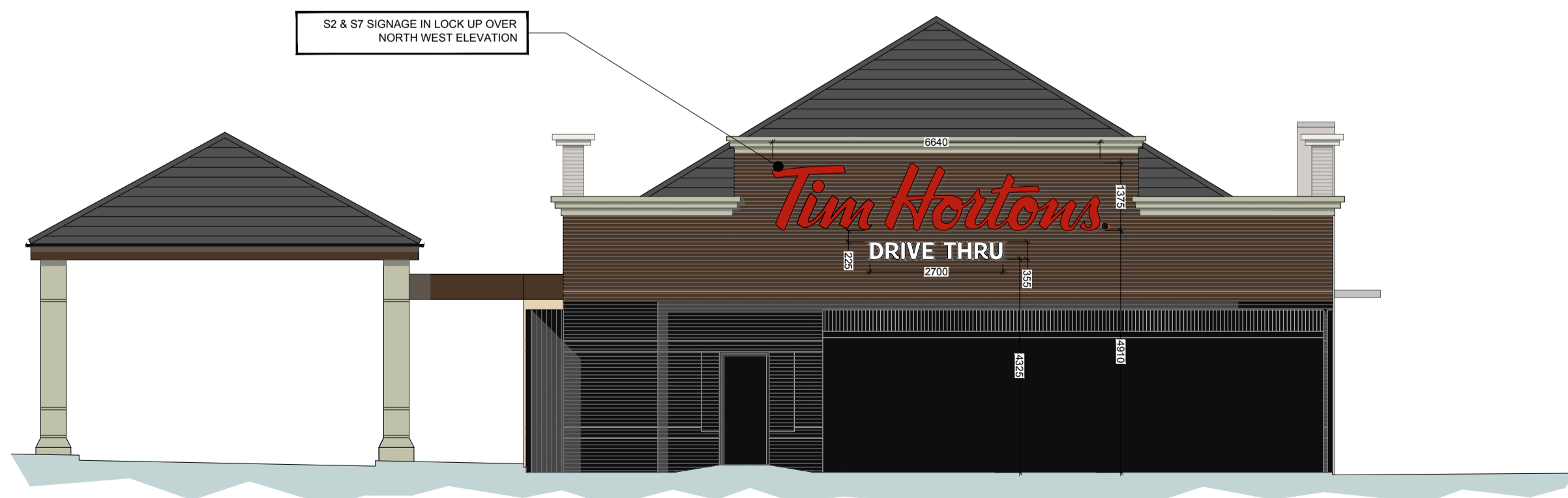
D ELEV SCALE 1:100 @ A1 PROPOSED NORTH WEST ELEVATION