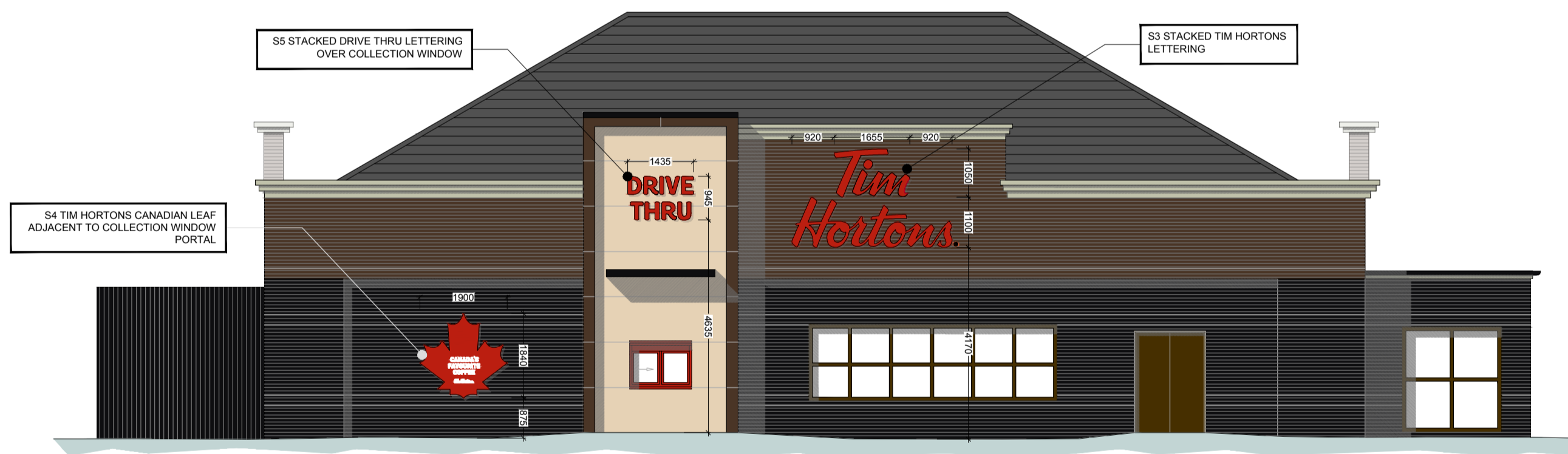
C ELEV SCALE 1:100 @ A1 PROPOSED SOUTH WEST ELEVATION