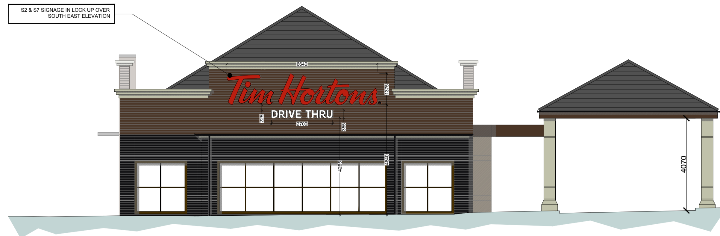
B ELEV SCALE 1:100 @ A1 PROPOSED SOUTH EAST ELEVATION