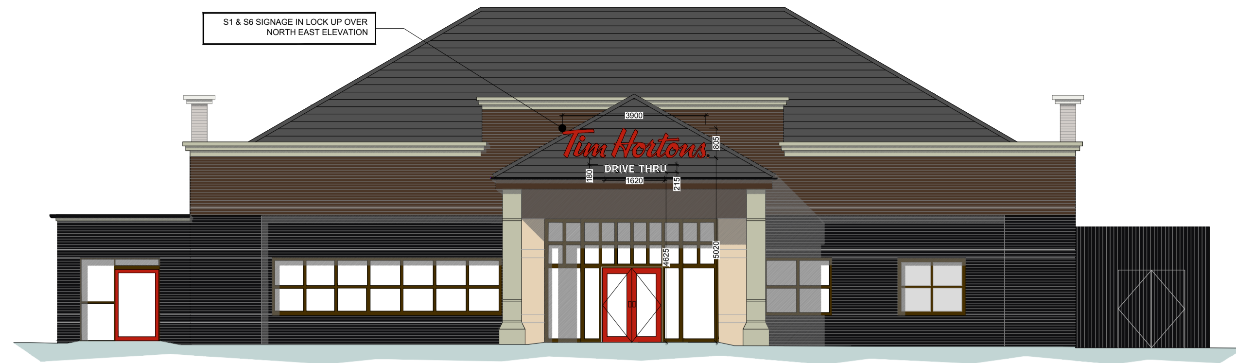
A ELEV SCALE 1:100 @ A1 PROPOSED NORTH EAST ELEVATION