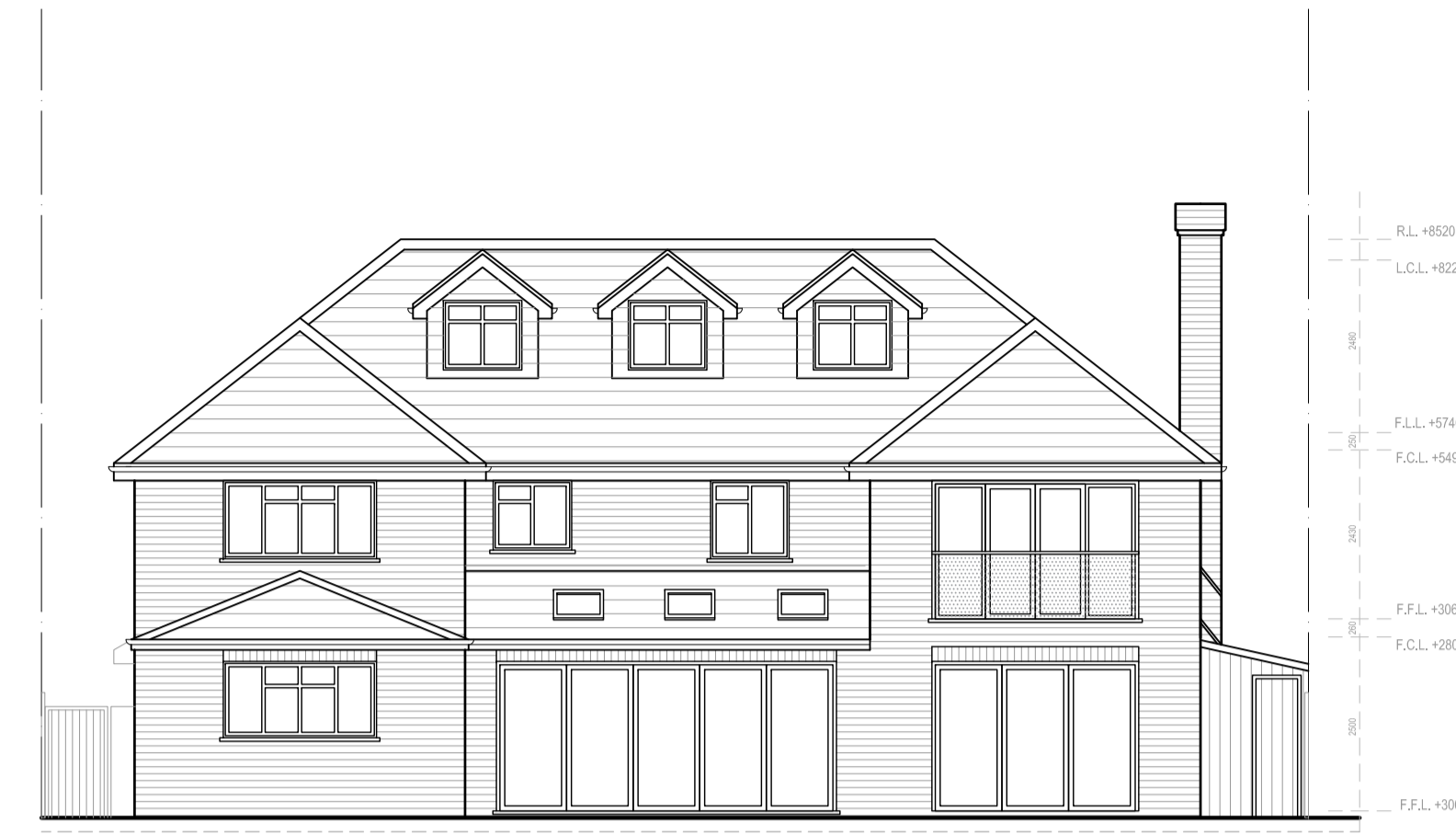
PROPOSED REAR WEST ELEVATION