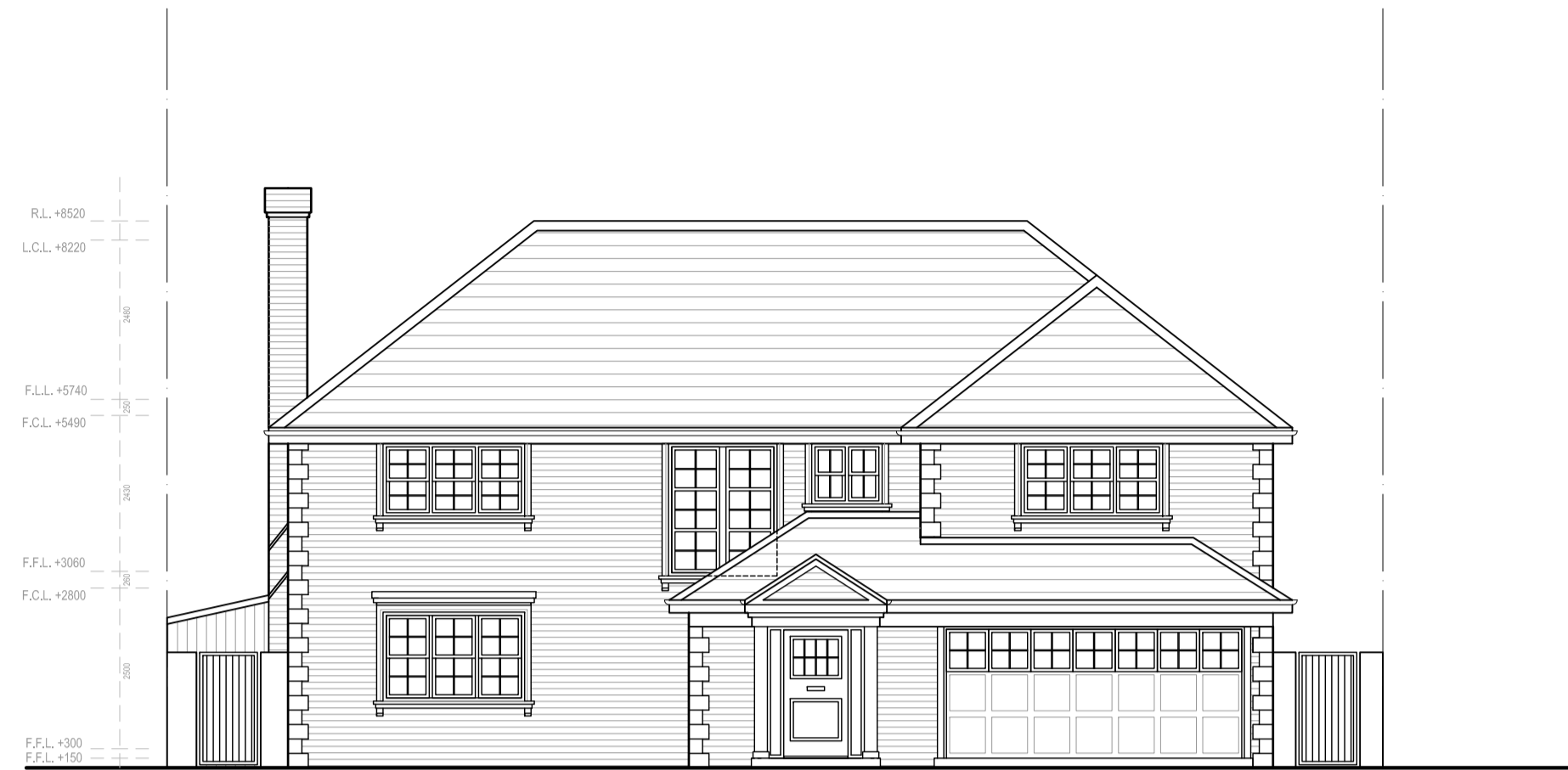
PROPOSED FRONT EAST ELEVATION