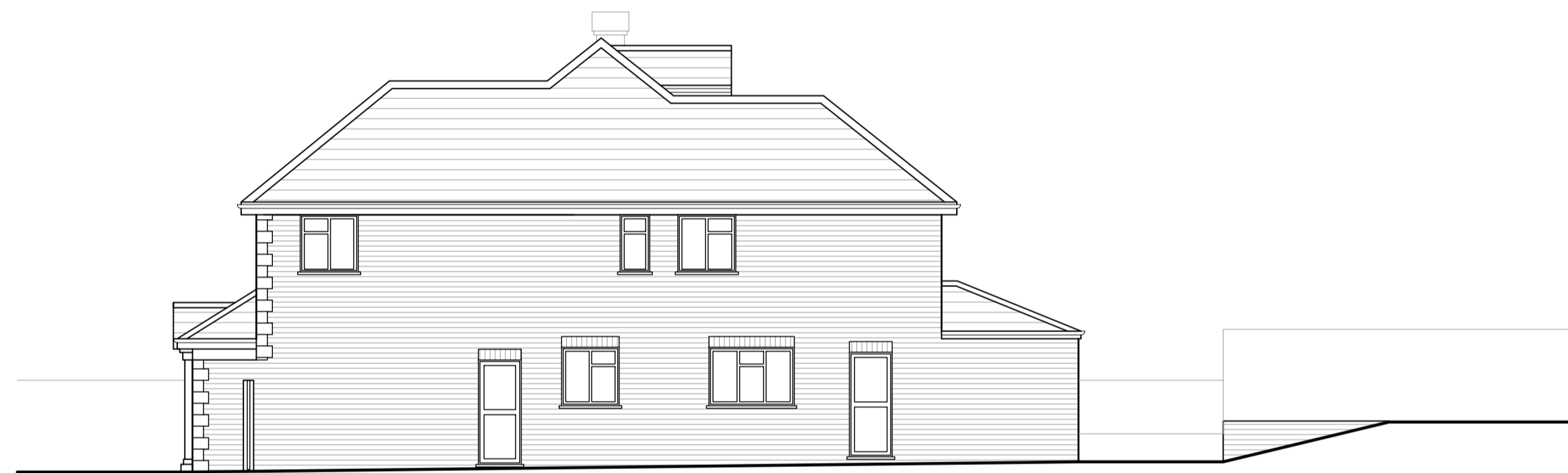
PROPOSED SIDE NORTH ELEVATION