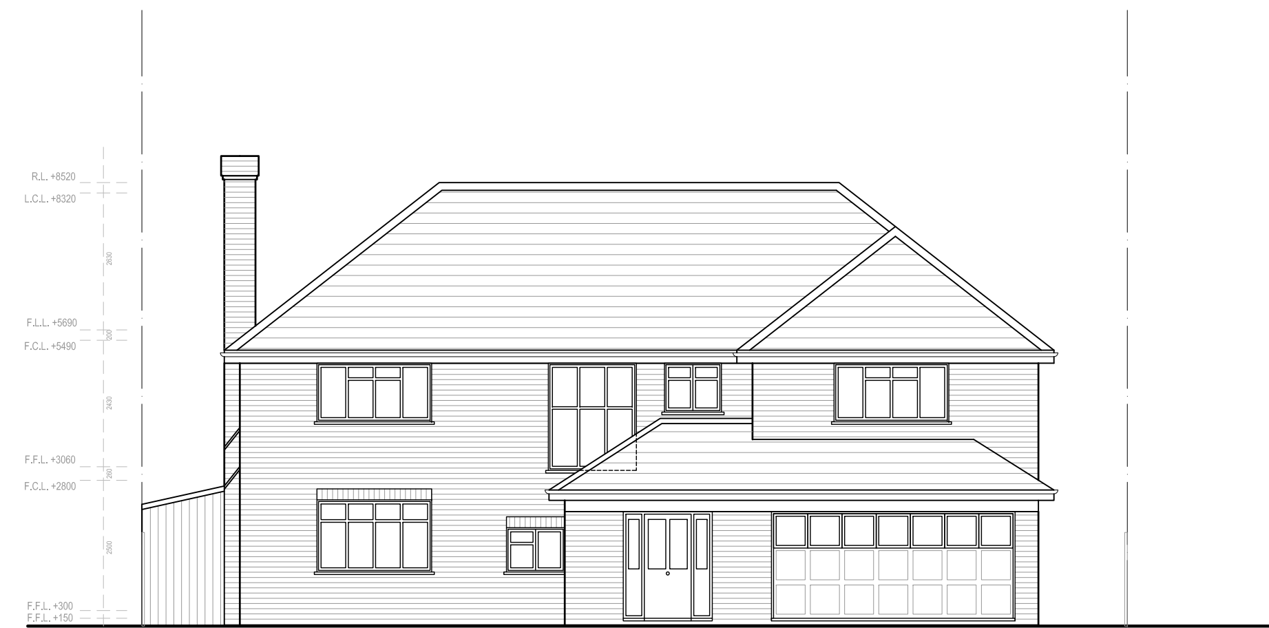
EXISTING FRONT EAST ELEVATION