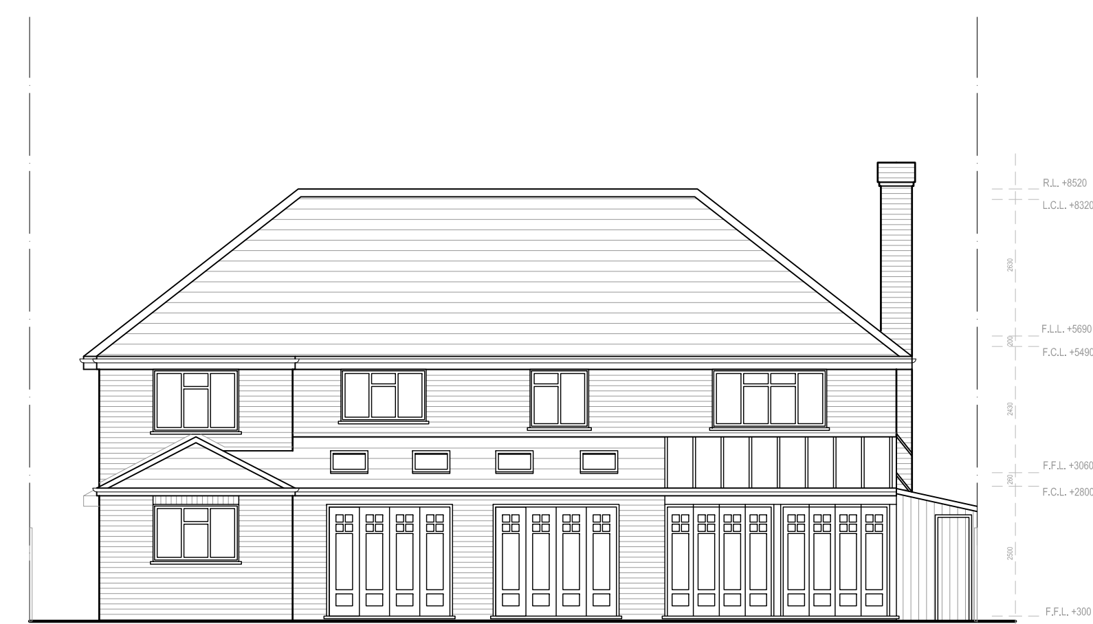
EXISTING REAR WEST ELEVATION