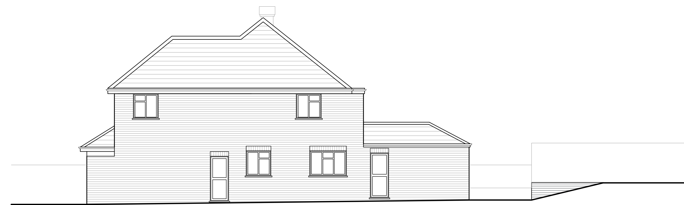
EXISTING SIDE NORTH ELEVATION