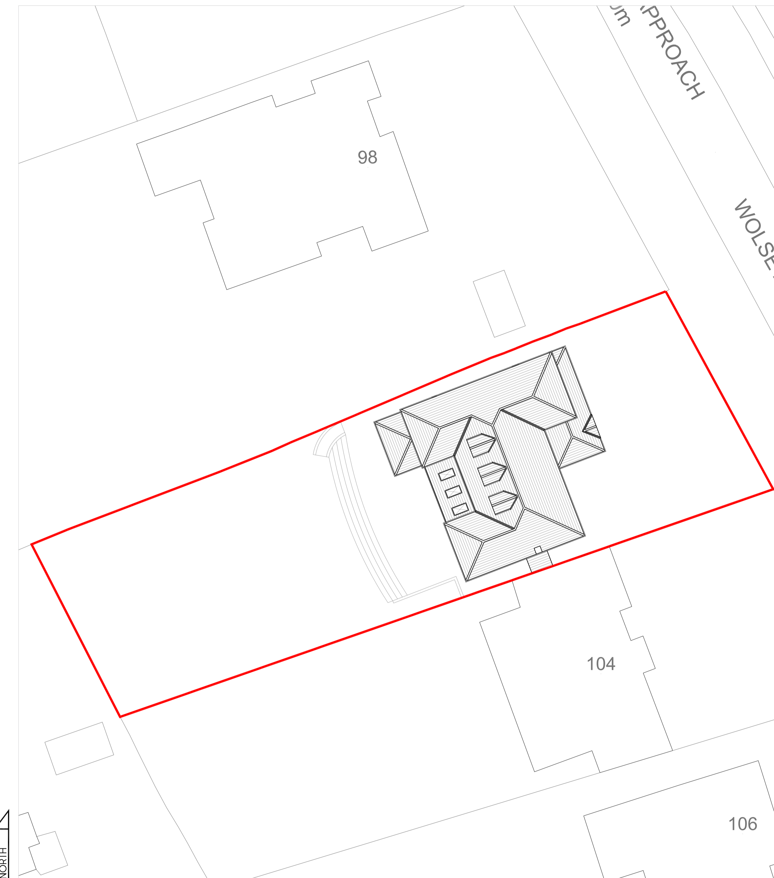
PROPOSED SITE PLAN Scale 1:200