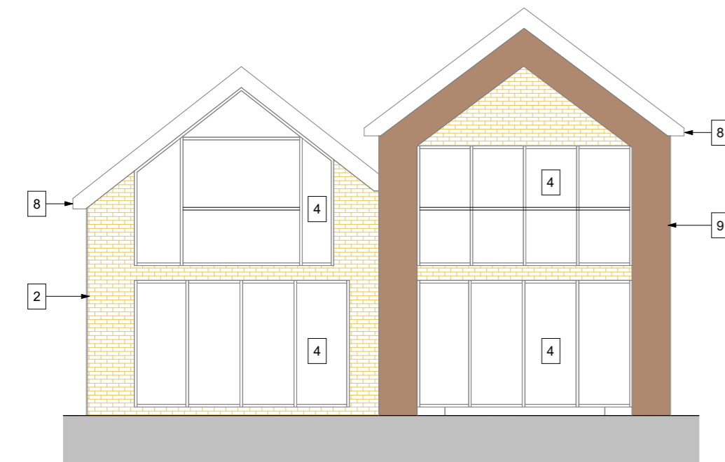
3 Proposed Rear PP03 1 : 50