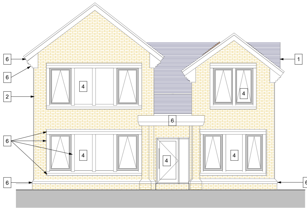
1 Proposed Front PP03 1 : 50