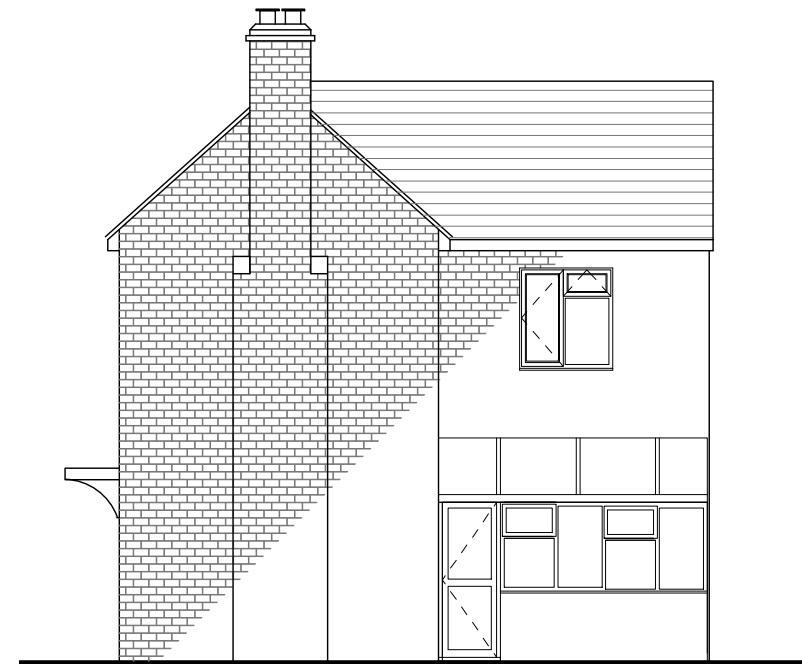
1:100 Existing Side Elevation