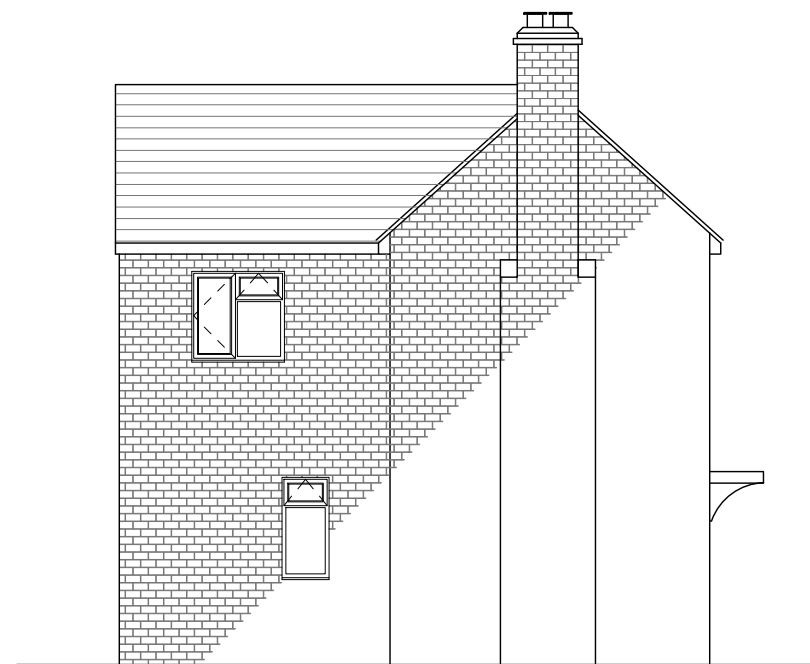
1:100 Existing Side Elevation