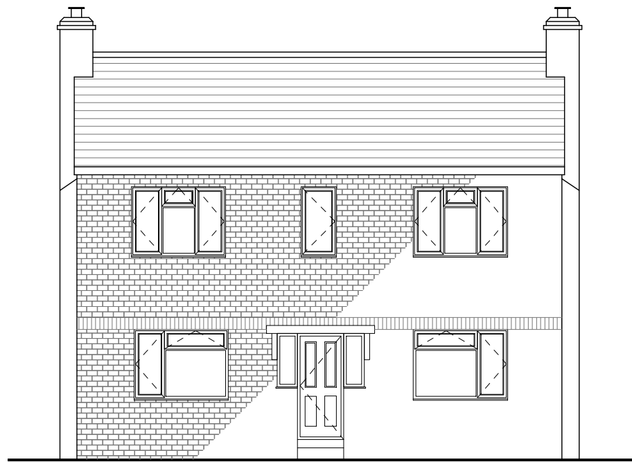
1:100 Existing Front Elevation